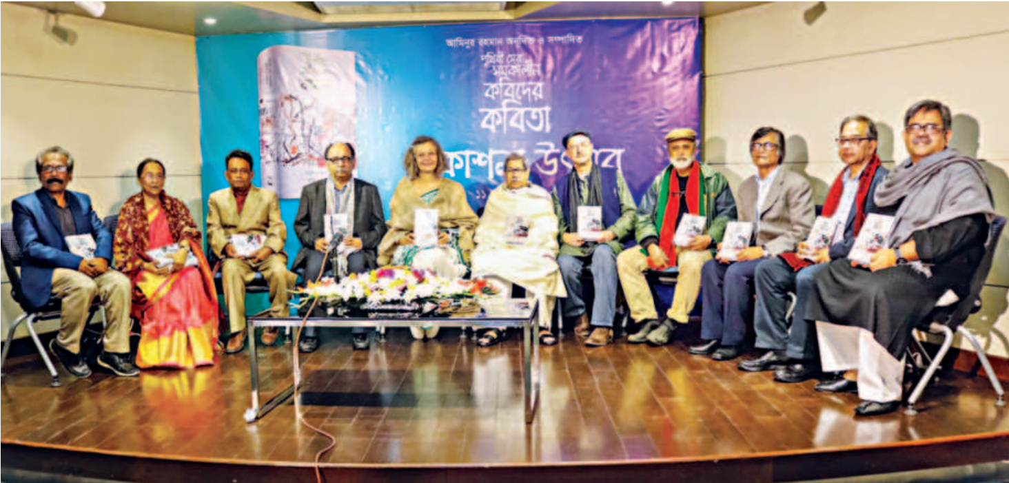
Special guests, organisers and featured poets at the programme.