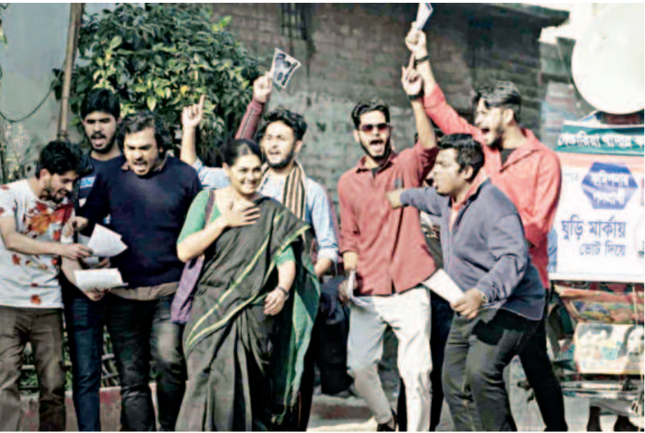
A still from the tele-fiction.