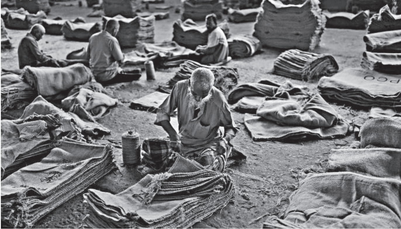
The state-run jute industry is confined to a vicious cycle of mismanagement and resultant financial loss that has threatened the very existence of the industry at a time when the global market of jute products is increasing significantly.

several conditions—one of which was that the BJMC would not use it for any other purpose than the disbursement of outstanding wages and financial benefits of the workers. However, according to BJMC officials, the fund was too small to pay all the dues and implement the new salary scale, as the corporation has to spend around Tk 650 crore to pay salaries and wages for all of its workers and employees annually. At present, BJMC is asking for more funds from the government while the jute mill workers are passing days in abject poverty.