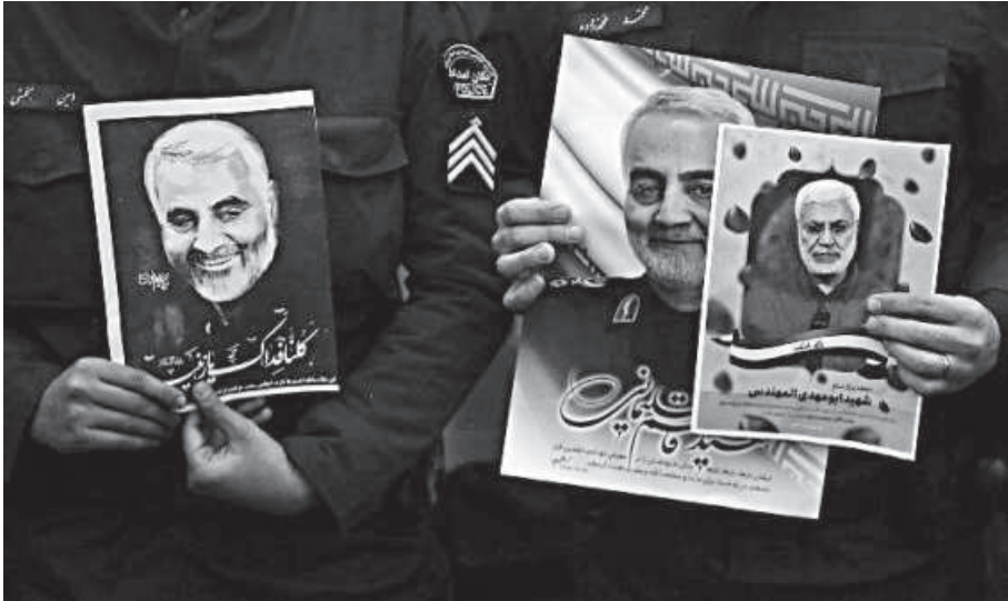
Iranian guards hold a picture of the late Iranian Major-General Qassem Soleimani, head of the elite Quds Force, in front of the United Nations office in Tehran, Iran, on January 3, 2020.

Third, in the aftermath of Soleimani’s assassination, the US and NATO announced that they were suspending their anti-IS initiatives in Iraq because they were concerned about the safety of their personnel, and they focused on countering retaliatory attacks, as they braced for reaction from the fallen general’s homeland. This interlude in the international forces’ activities against the IS, coupled with the distraction on the Iranian and PMF side, will aid the