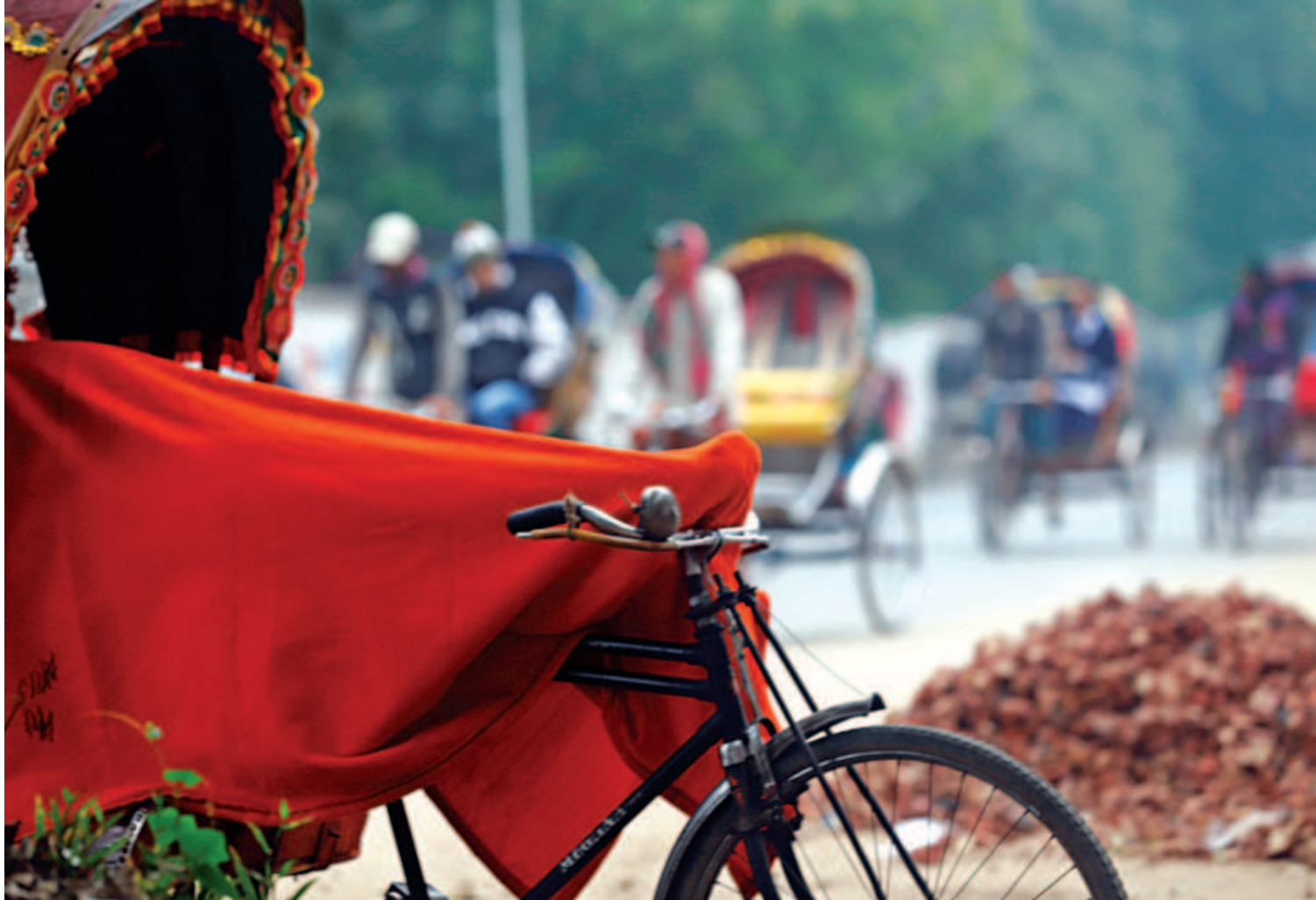
With no place to take a break in the cold, gloomy afternoon yesterday, a rickshaw puller, wrapping himself a blanket, takes a nap on the precarious bed he had made on his rickshaw. The photo was taken inside Dhaka University campus.