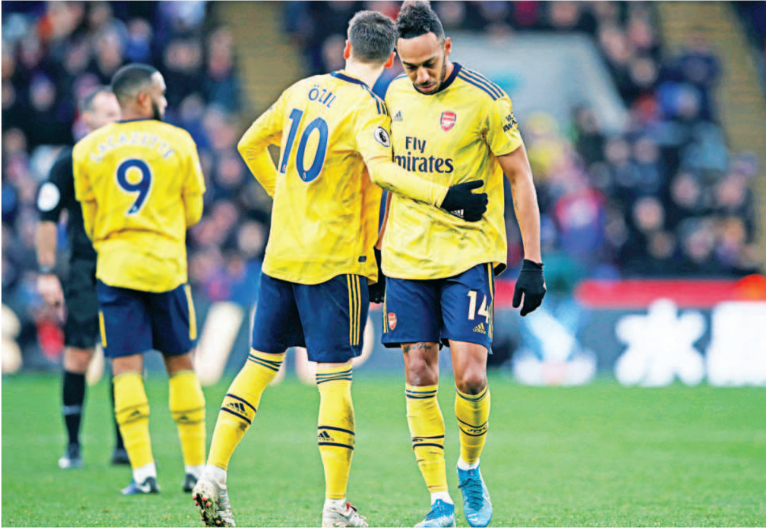
Arsenal's Pierre-Emerick Aubameyang (R) was distraught after receiving his marching orders in yesterday's English Premier League encounter with Crystal Palace at Selhurst Park. Aubameyang put Arsenal ahead in 12th minute, however, Jordan Ayew's equaliser ensured a 1-1 draw.