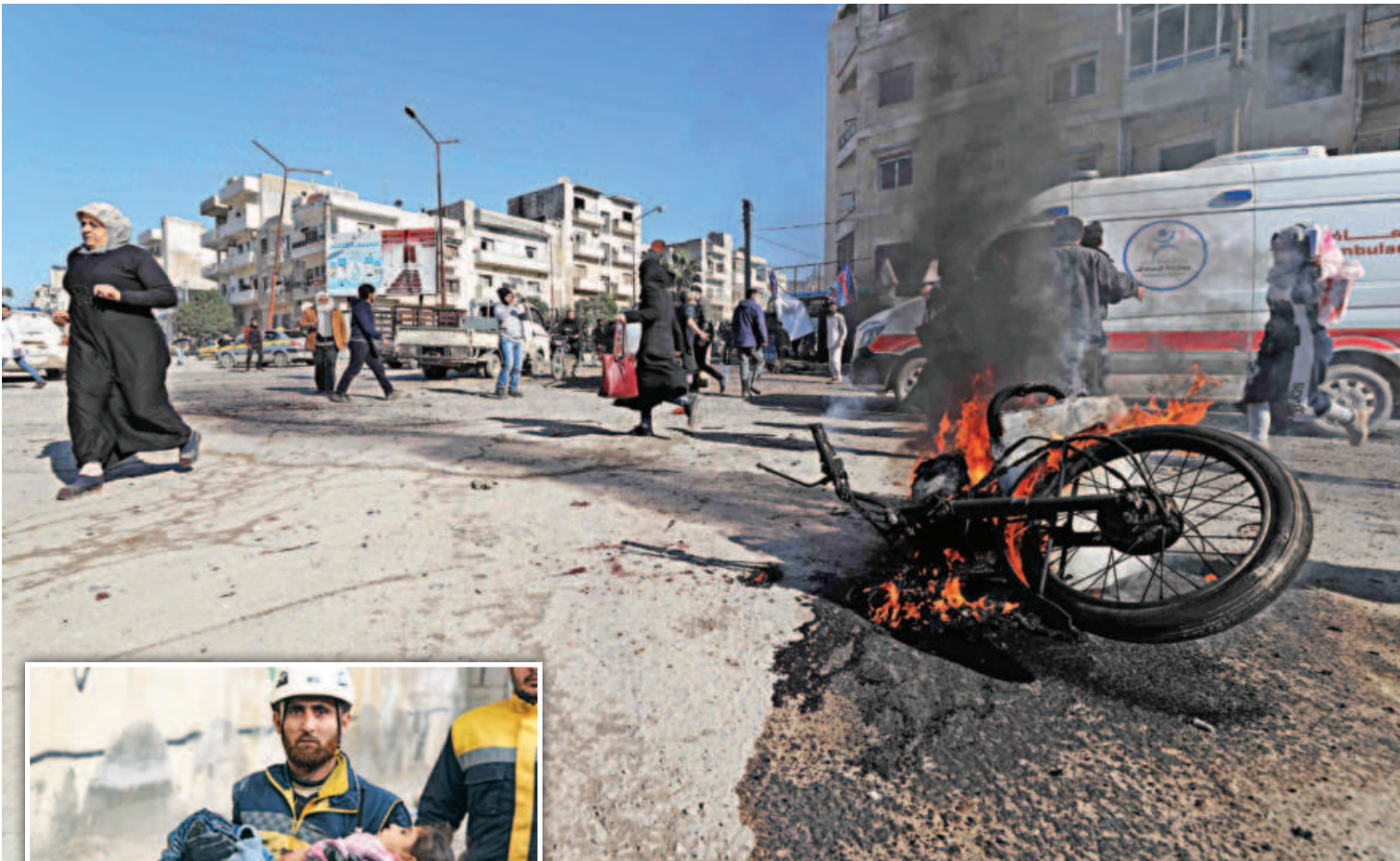
Panicked residents run following an air strike by pro-regime forces in the northwestern Syrian city of Idlib yesterday. Inset , an injured Syrian child is carried by a White Helmets rescue worker. At least 18 civilians were killed in the air strike, a war monitor said, one day before a planned ceasefire is due to take effect.

Some Iranians called for resignation of officials, dismissing their apologies.