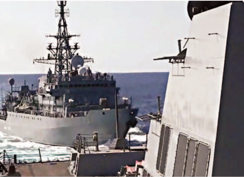
A handout image released yesterday shows a Russian naval ship sails close to the US Navy destroyer USS Farragut during an incident in the northern Arabian Sea on Thursday. The incident is the latest example of a close encounter between US and Russian military forces that American officials have described as unsafe or provocative.

More than 100 countries have pledged to redouble their efforts to reduce domestic emissions, but the biggest polluters -- China, India, the US and the European Union -- have yet to unveil new plans.