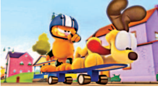
The Garfield Show

show will air every day at 12:30 pm and 5:30 pm, starting from today.