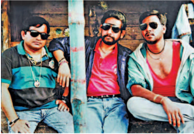
Kothau Keu Nei