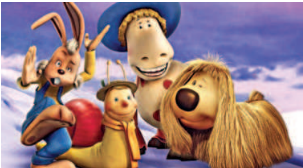
The Magic Roundabout