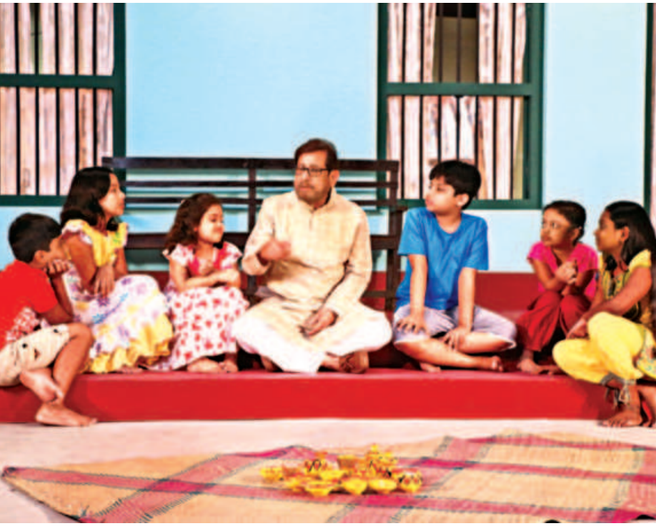
Golpo Sheshe Gumer Deshe