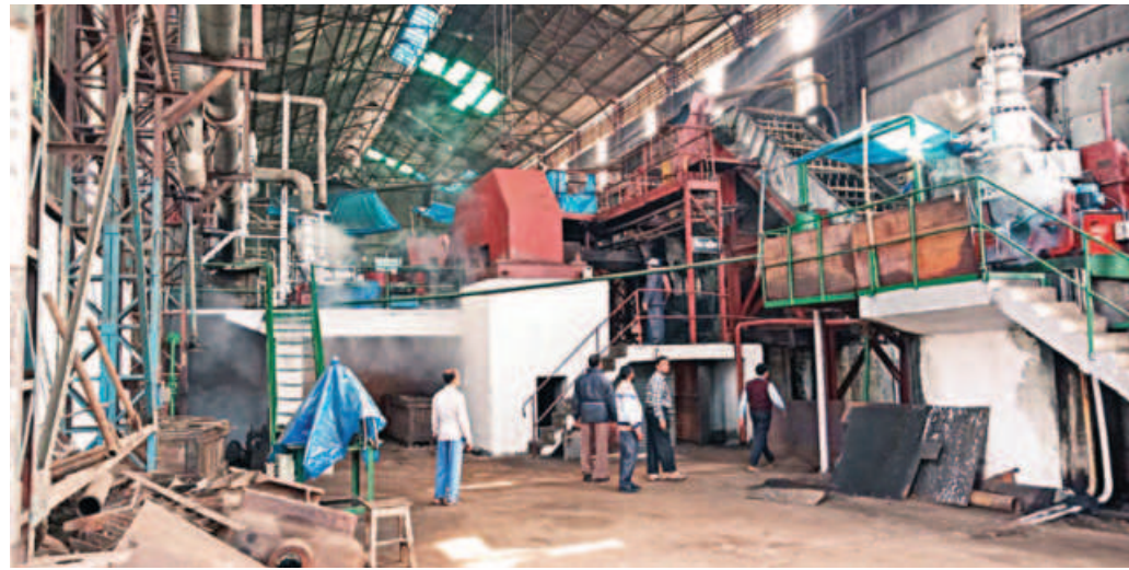
The country is nearly completely dependent on sugar imports. Its 15 state-run sugar mills produced 68,562.50 tonnes of sugar in 2017-2018 whereas 26.95 lakh tonnes were consumed.