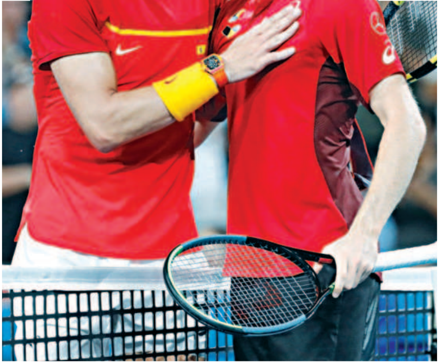
World No.1 Rafael Nadal (L) suffered a shock 6-4, 7-6 (7/3) loss to David Goffin in the ATP Cup in Sydney yesterday. However, Nadal made amends by helping secure a 6-7 (7/9), 7-5, 10-7 win in doubles to keep Spain alive.