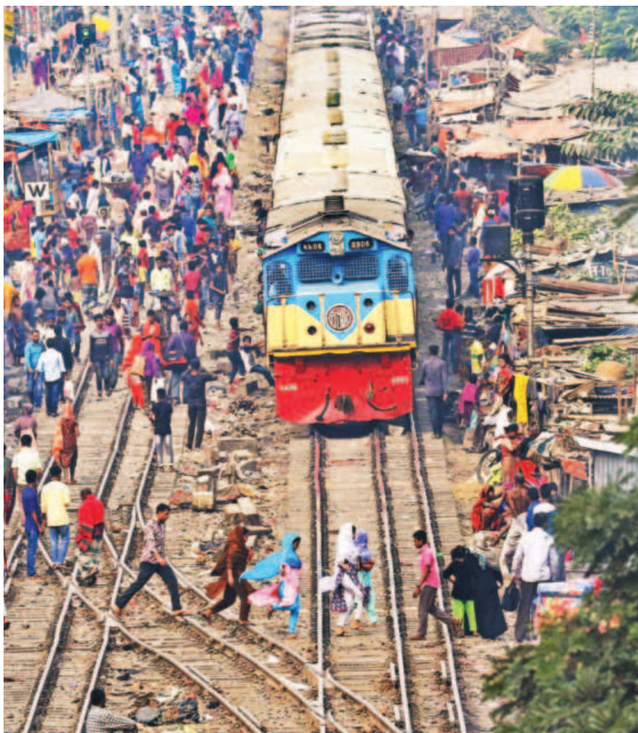
With a moving train just a few yards away, people cross the rail lines in the capital's Tejgaon area, putting their lives at risk. The photo was taken recently.