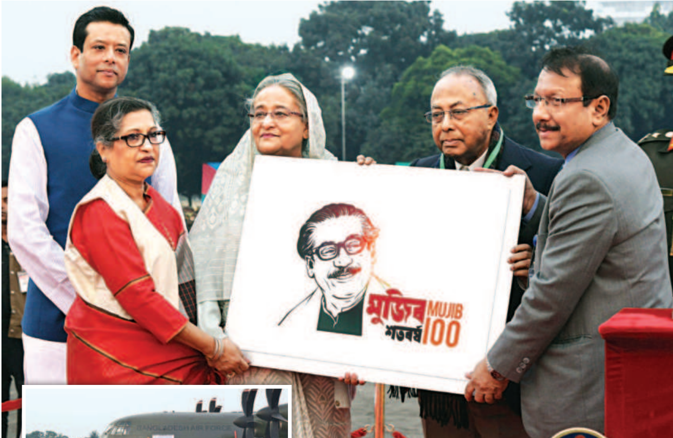
Prime Minister Sheikh Hasina unveiling the logo of Mujib Borsho at the capital's National Parade Square yesterday. She started the countdown for the birth centenary celebration of Father of the Nation Bangabandhu Sheikh Mujibur Rahman. Inset , a laser image of Bangabandhu at the door of a plane recreates the moment of his arrival home 48 years ago.