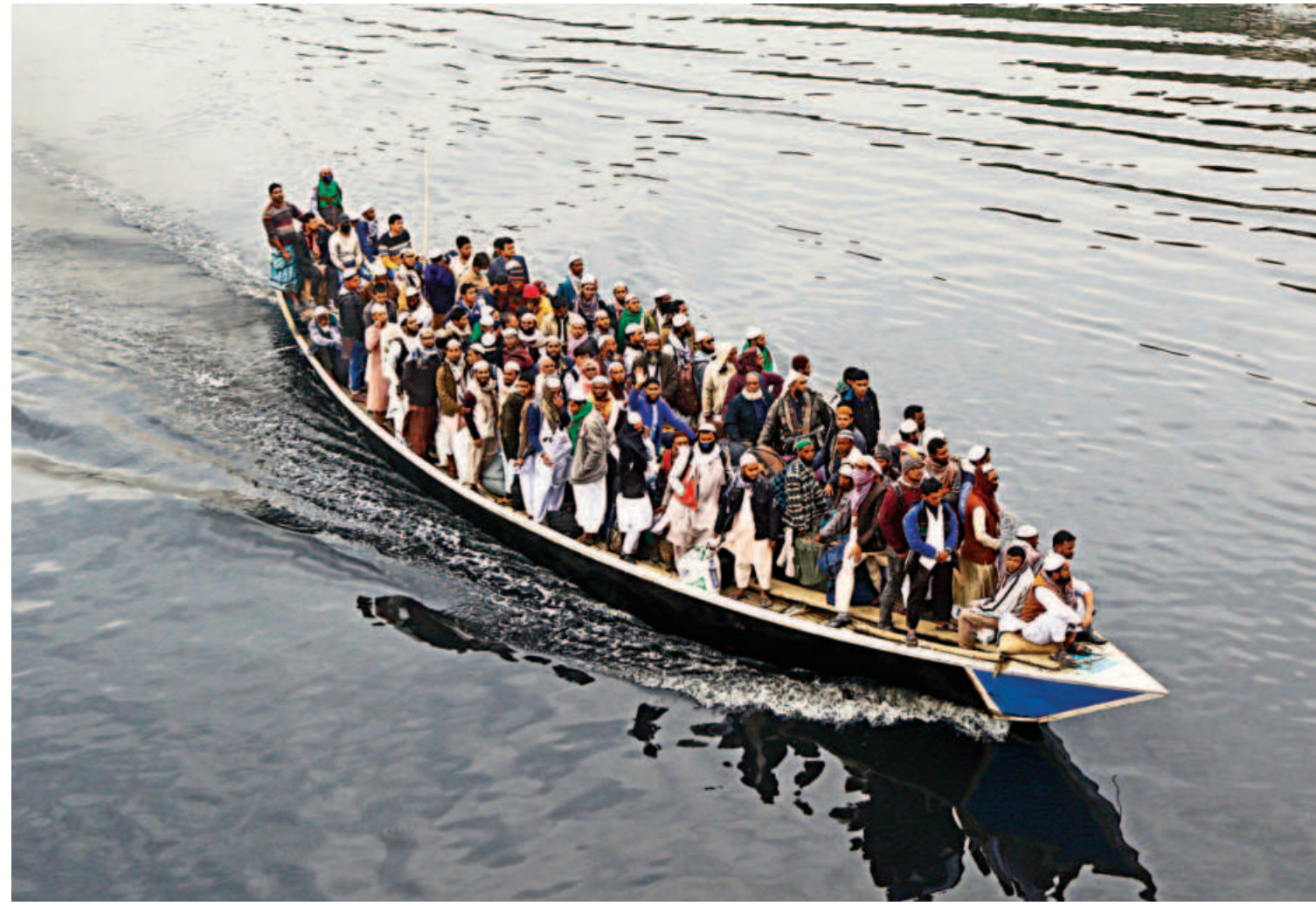
A boat carrying devotees heads to the Ijtima ground on the bank of the Turag river. The two-day first phase of the Biswa Ijtima, the second largest congregation of Muslims after Hajj, will begin today. The photo was taken in Tongi of Gazipur yesterday.