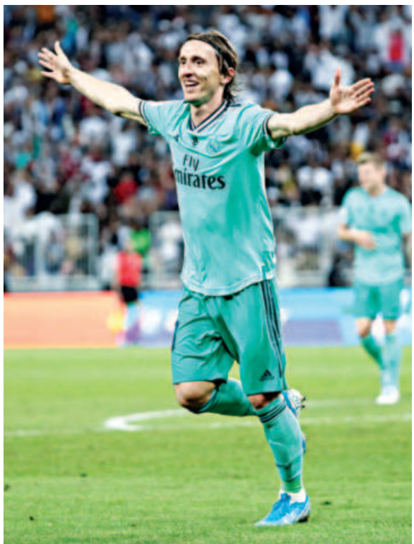
Real Madrid's Luka Modric celebrates after scoring the final goal of a 3-1 win over Valencia in a Spanish Super Cup encounter in Jeddah on Wednesday.

But it is the new location that has grated most, because of the lack of consideration for Spanish fans and the implications of associating with a country that has been heavily criticised for its treatment of women and record over human rights.