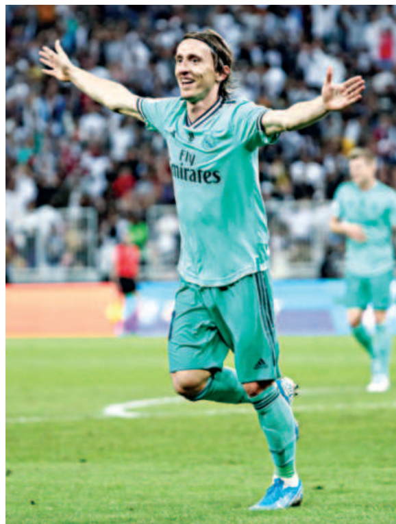
Real Madrid's Luka Modric celebrates after scoring the final goal of a 3-1 win over Valencia in a Spanish Super Cup encounter in Jeddah on Wednesday.

But it is the new location that has grated most, because of the lack of consideration for Spanish fans and the implications of associating with a country that has been heavily criticised for its treatment of women and record over human rights.