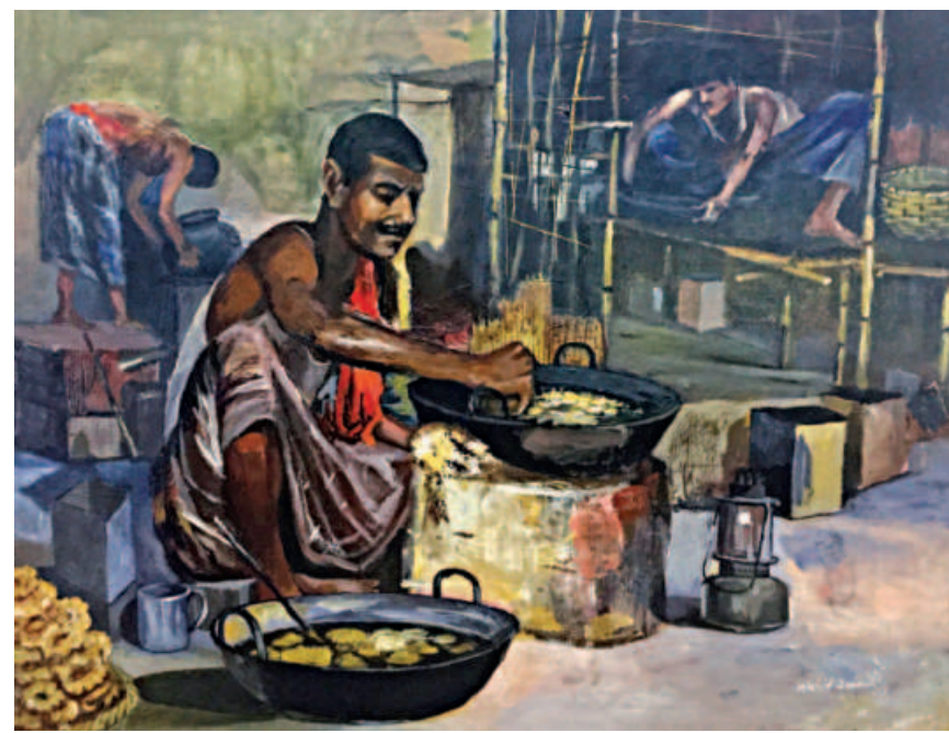
Artworks on exhibit at the event.