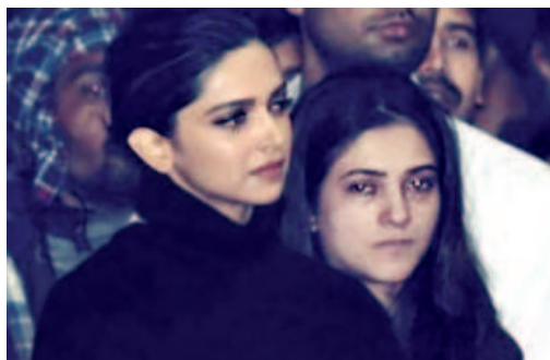
Deepika Padukone with the students of JNU.

Clad in a black turtleneck, Deepika, who was in the city to promote her forthcoming film Chhapaak , attended a public meeting held by the JNU Students' Union (JNUSU) and Teachers' Association, against the attack on students by masked men and women armed with sticks and iron rods. The attack resulted in more than twenty people getting injured and hospitalised. Deepika, however, did not address the crowd. She stood by as former JNUSU president, Kanhaiya Kumar, raised slogans and left just as current President Aishe Ghosh, who too was injured in the attack, began to speak.