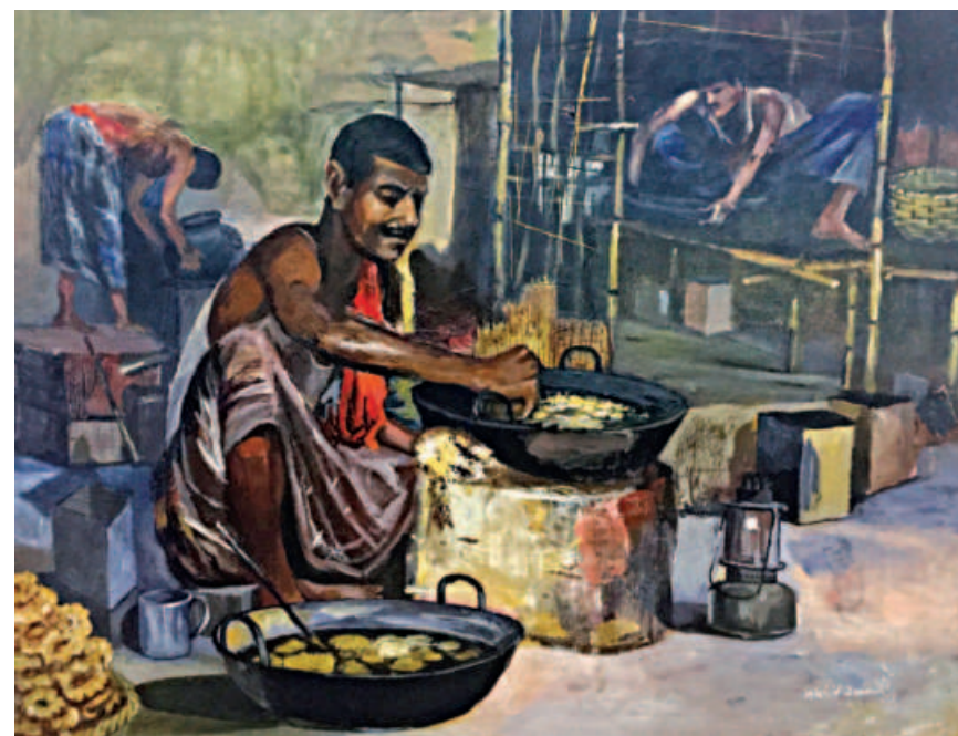
Artworks on exhibit at the event.