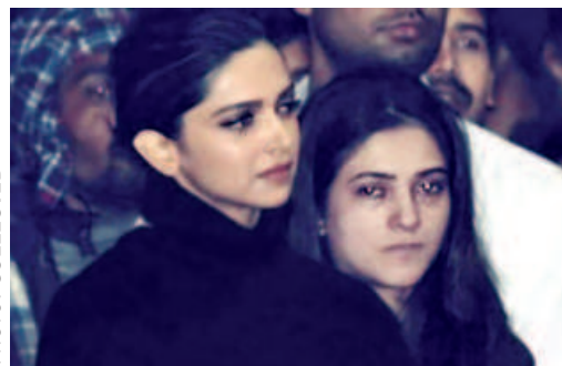
Deepika Padukone with the students of JNU.