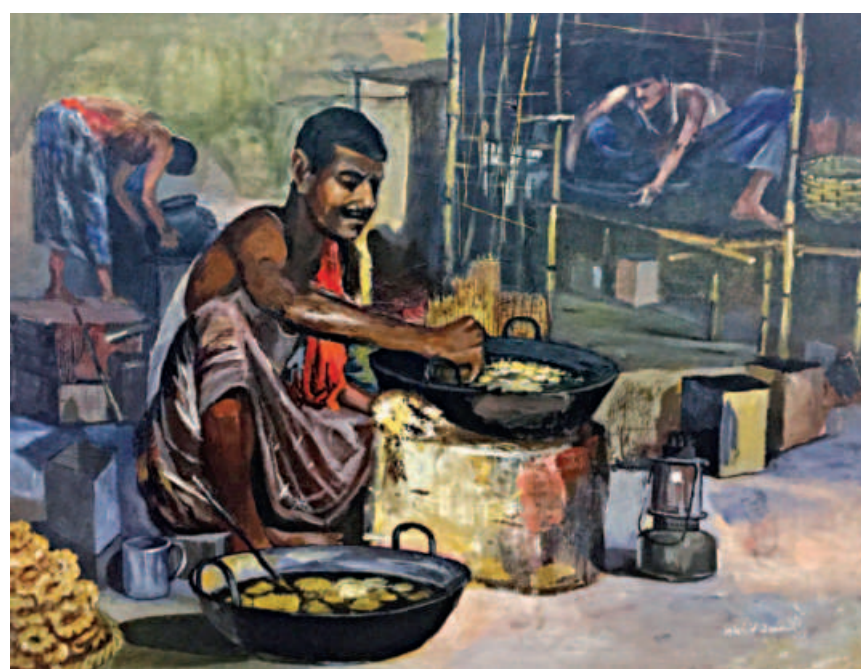
Artworks on exhibit at the event.