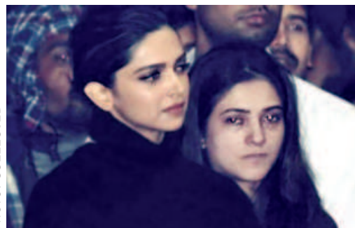
Deepika Padukone with the students of JNU.