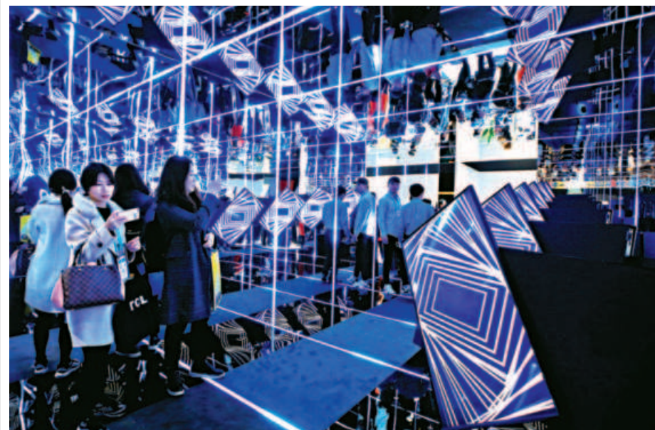
The Sera, a television that can be viewed horizontally or vertically, is displayed in the Samsung booth during the 2020 CES in Las Vegas, US on January 7.