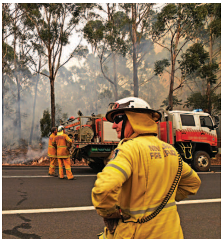
Volunteers of the Rural Fire Service and officers of the Fire and Rescue NSW contain a small bushfire which closed the Princes Highway south of Ulladulla, Australia.

Thousands of people have already been left homeless by the fires that have scorched through more than 10.3 million hectares (25.5 million acres) of land - an area the size of South Korea. In rural areas, many towns were without