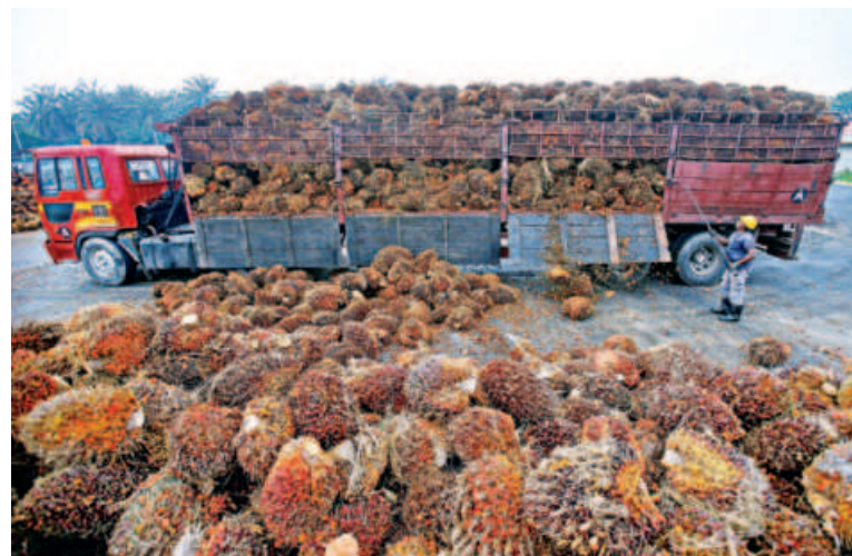
A worker unloads palm oil fruits from a lorry inside a palm oil factory in Salak Tinggi, outside Kuala Lumpur, Malaysia.

Last month, Mahathir, prime minister of a predominantly Muslim nation, also waded into the debate about India's new citizenship law, which has led to violent protests in India and at least 25 deaths in clashes with police.