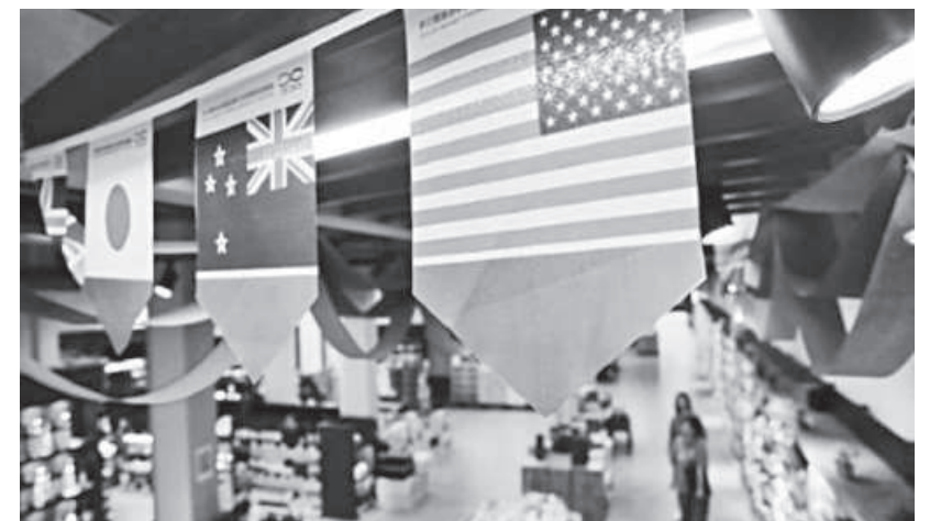
Foreign firms are no longer obligated to have a Chinese partner to start a business in the country.