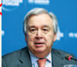
Un Secretary General Antonio Guterres

'DANGEROUS TIMES' 'We are living in dangerous times. ... This cauldron of tensions is leading more and more countries to take unpredictable decisions with unpredictable consequences and a profound risk of miscalculation. ... Let us not forget the terrible human suffering caused by war. As always, ordinary people pay the highest price. It is our common duty to avoid it.'