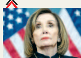
US Speaker Nancy Pelosi

'This action (attack on Iranian general) endangered our servicemembers, diplomats and others by risking a serious escalation of tensions with Iran. As members of Congress, our first responsibility is to keep the American people safe. For this reason, we are concerned that the administration took this action without the consultation of Congress and without respect for Congress's war powers granted to it by the Constitution.'