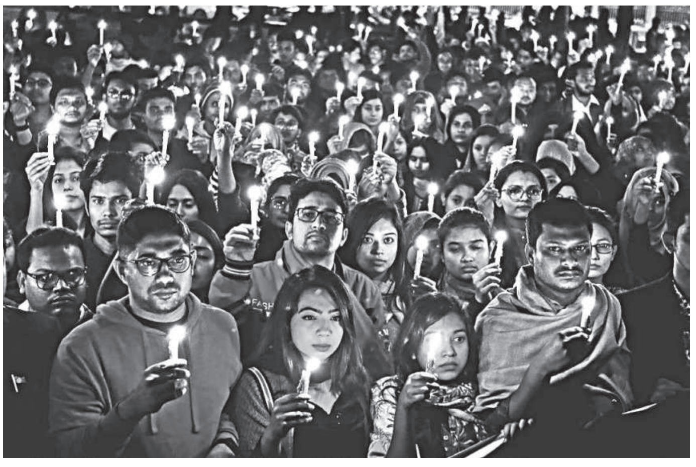
Students under the banner of Dhaka University Central Students' Union (Ducsu) hold a candlelight vigil on the Central Shaheed Minar premises, demanding justice for a fellow student who was raped in the capital's Kurmitola area on Sunday night.

A Dhaka University student being raped and left unconscious in a busy area speaks volumes of just how far this social