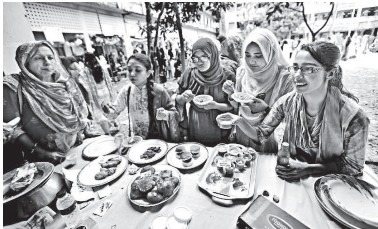
WARMING UP WITH PITHA. Winter and pitha are synonymous in Bangladesh. From homes to street corners, the delicious steam wafting from plates of pitha never fails to bring smile to faces. This photo was taken from Sylhet Government Women's College, where students organised a daylong "Pitha Utsab" yesterday.

Among others, Communist Party of Bangladesh, Manobadhikar Sanskriti Foundation and Chhayanaut also issued statements condemning the attack.