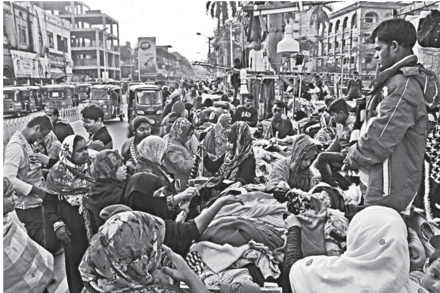
Shoppers busy going through winter clothes at makeshift shops on a footpath beside Zila Parishad Pukur Par in Barishal city. With cold wave sweeping through the country, sale of warm clothes has shot up. This photo was taken yesterday afternoon.

He also urged the officers-in-charge (OCs) to turn their police stations into model ones. "We want to build every police station as symbols of confidence and dependence for people," the IGP added.