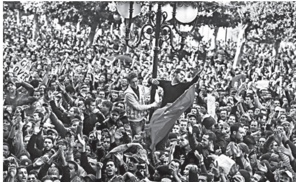
Protesters demonstrate against then Tunisian President Zine al-Abidine Ben Ali in Tunisia, on January 14, 2011.

reforms in the political and economic arenas. Admittedly, these protests were met with mixed results. For example, while the Arab Spring led to positive changes in Tunisia, similar protests led to civil wars in Libya, Syria, and Yemen.