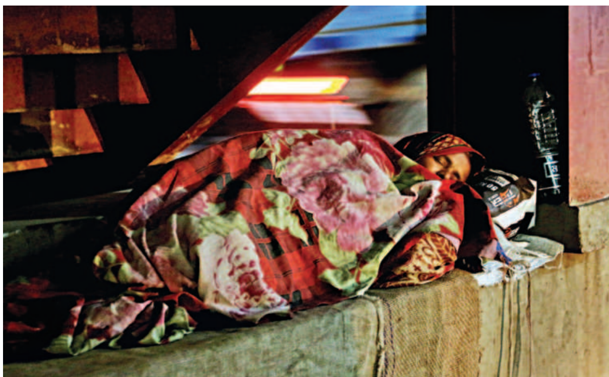
It's been a little colder in Dhaka over the past couple of nights, making the lives of people living on streets more difficult. This woman was sleeping under a footbridge at Kazi Nazrul Islam Avenue on Monday, trying her best to stay warm.