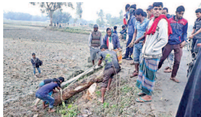
Police seize logs of illegally felled trees beside Kashipur-Lalmonirhat road at Gobai village in Mahendranagar union of Lalmonirhat Sadar upazila on Monday.