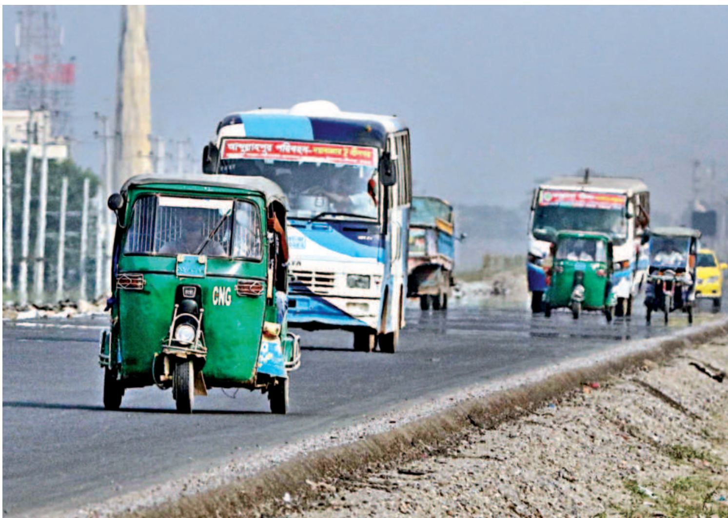
Defying a ban, CNG- and battery-run three-wheelers ply the Dhaka-Mawa highway in Keraniganj. Such violations of traffic rules often lead to road crashes. The photo was taken on Saturday.