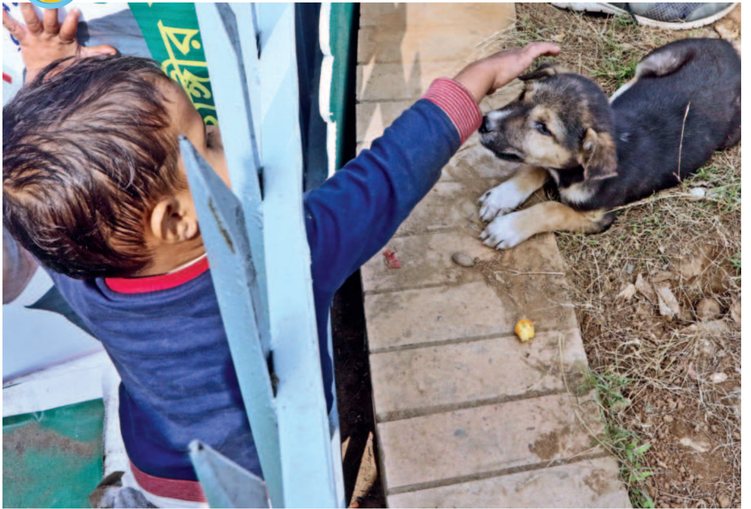
No barrier high enough when it comes to petting cute puppies, as proven by this child who extends his arm through a metal grille to make a new friend. This photo was taken yesterday from Dhaka University's TSC area.