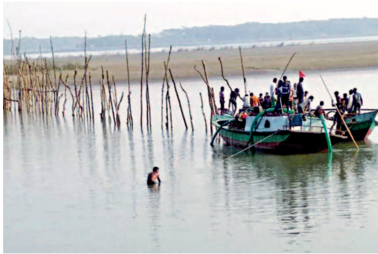
A group of local influential persons in Barishal's Mehendiganj upazila set up illegal bamboo enclosures in the canal for fish cultivation.

Local UP chairman and some influential persons allegedly set up bamboo enclosures in Vuter Khal for pisciculture