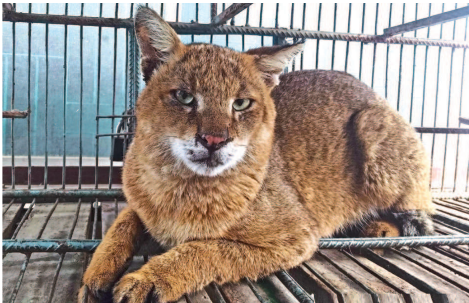
Officials of the Wildlife Crime Control Unit of Forest Department yesterday rescued a wildcat from Panchabati area in Narayanganj's Fatullah. The animal was rescued from the warehouse of a garment factory. Employees of the company on Sunday found the feline hiding in a pile of rubbish. Sensing their presence, it jumped at them, which prompted them to capture it. Upon searching the internet, the staff realised the cat belonged to an endangered species and informed the forest department.