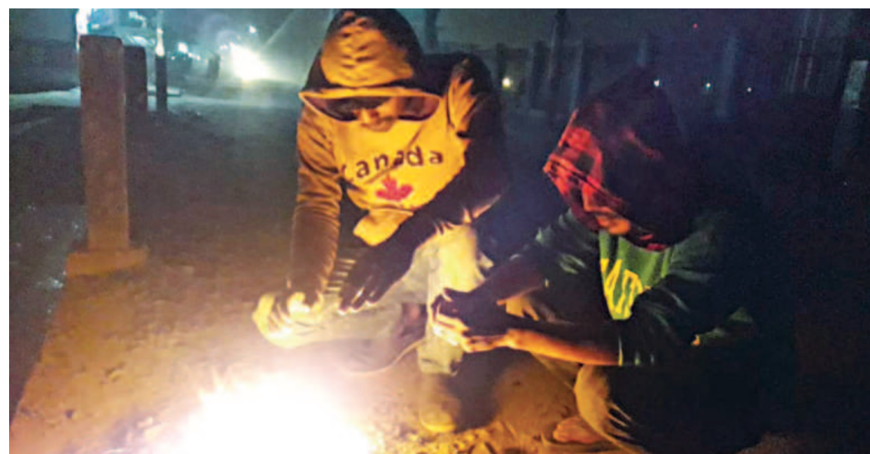
Two men warm themselves up around burning wastes. The prevailing dense fog, coupled with the chill, has made regular life difficult for all. The photo was taken from Thakurgaon municipality area on Monday night.

"Only a few years ago, the roads in Mahendranagar union were adorned with various types of trees but now most of them look barren due to continued tree looting," he said.