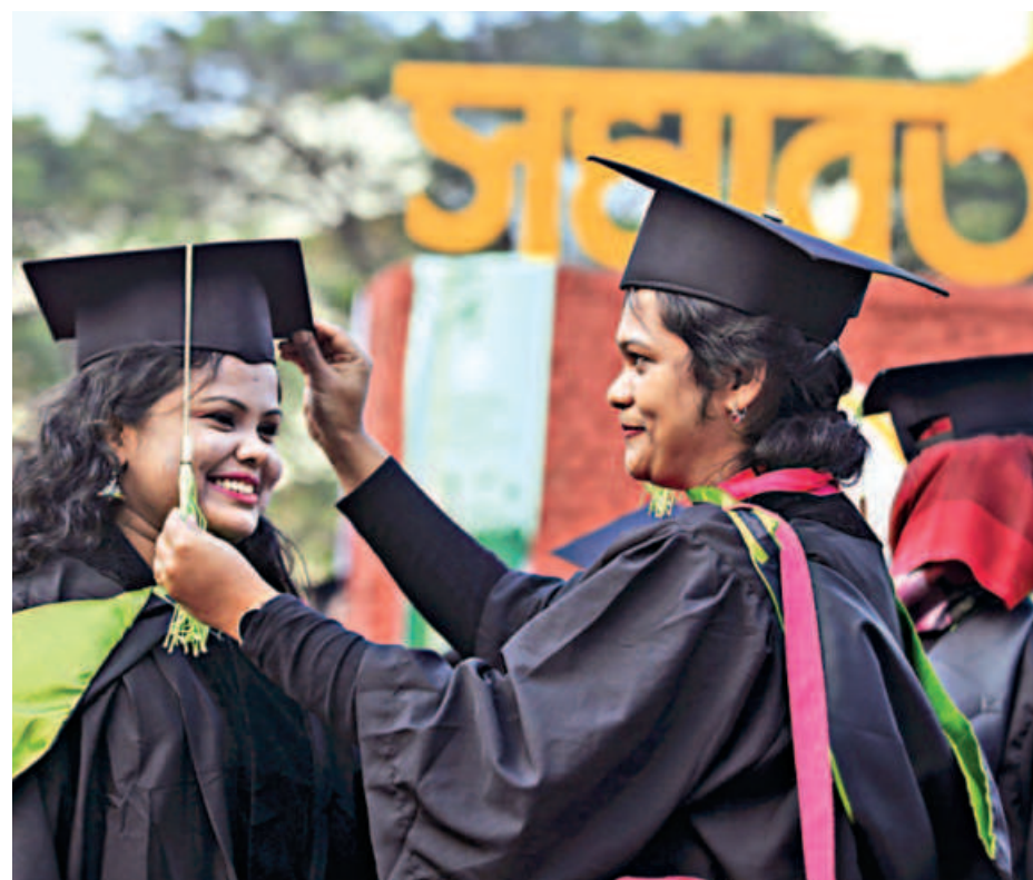
Smiling graduates were roaming around SUST yesterday, fixing each other's gowns and hats. It's been 12 years since the campus has experienced this celebration, so the pictures better turn out alright.