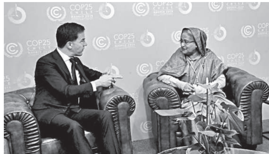
Prime Minister Sheikh Hasina of Bangladesh holds a meeting with her Dutch counterpart Mark Rutte on the sidelines of the 25th Conference of the Parties (COP25), in Madrid, Spain.

temperature goal between 2013 and 2015. This paragraph allowed the UNFCCC Secretariat to set up a scientific group to examine the difference of impacts between 2 degrees Centigrade warming and 1.5 degrees, and the expert report was published in 2015 which showed that while 2 degrees was good enough to protect most of the world's countries and people, it would still affect many millions of people living in the poorest countries. Hence, 1.5 degrees was essential if the