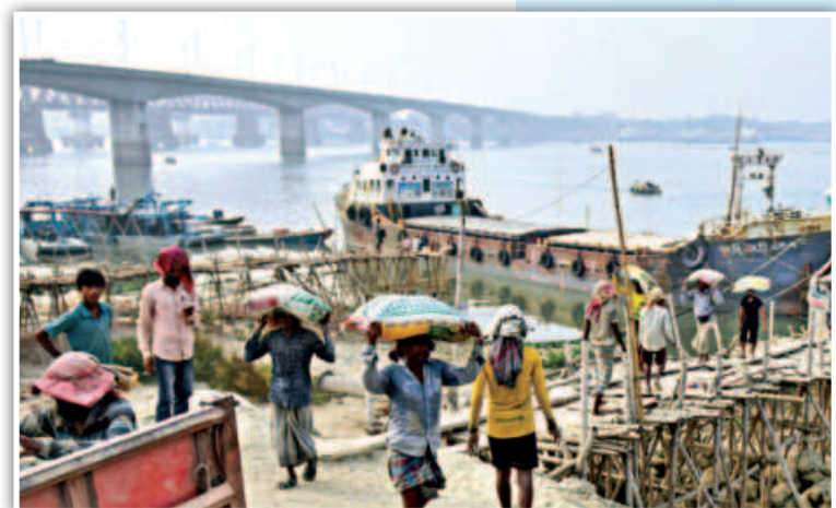
Illegal landing stations operate just beside President Zillur Rahman Railway Bridge, Shaheed Habildar Abdul Halim Railway Bridge and Syed Nazrul Islam Highway Bridge over the Meghna river at Ashuganj.