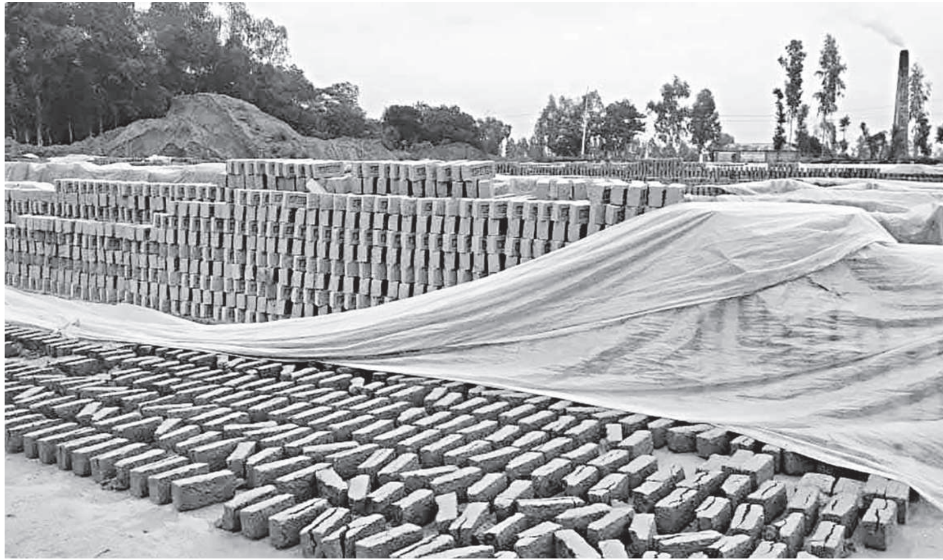
A huge quantity of unbaked bricks lie damaged on the premises of a brickfield in Kotbahuria area of Tangail's Mirzapur upazila.