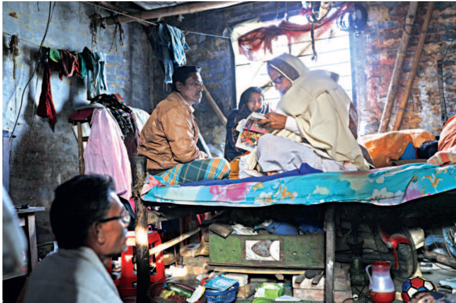
A family of five lives in this small dark room in the ramshackle quarters for workers of Platinum Jubilee Jute Mills Limited in Khulna's Khalishpur area. The quarters have been left unrepaired for more than half a century. Top right, due to a lack of space, workers have occupied this half-ruined building which was previously used as an auditorium for screening films. Bottom right, large holes in the ceilings of this building mean its residents have to move between floors using bamboo ladders poking through the holes. The photos were taken last month.

Jute workers protesting for unpaid wages is nothing new in Khalishpur area, SEE PAGE 10 COL 4