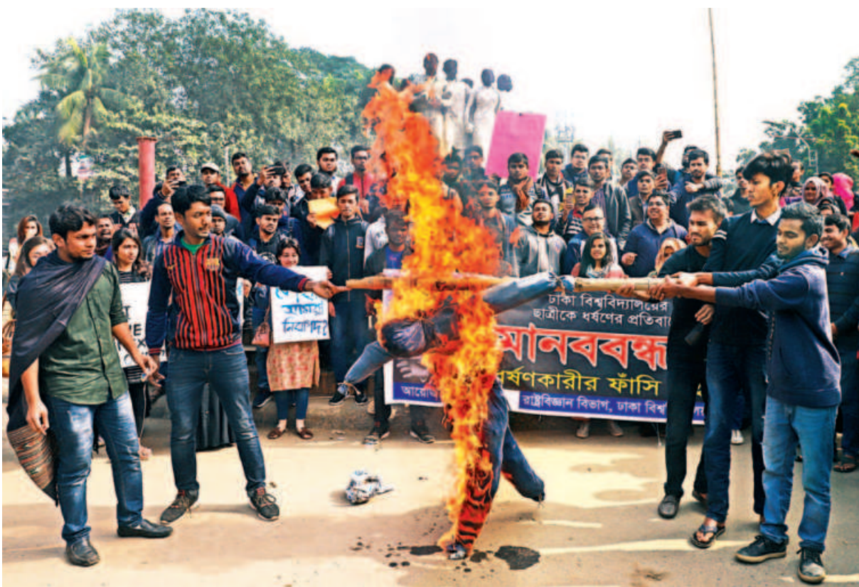
Protesters burn an effigy of the rapist of a Dhaka University student during a demonstration near the Raju Sculpture on the campus yesterday. They demanded exemplary punishment for the culprit for committing the crime in the city's Kurmitola area on Sunday night.