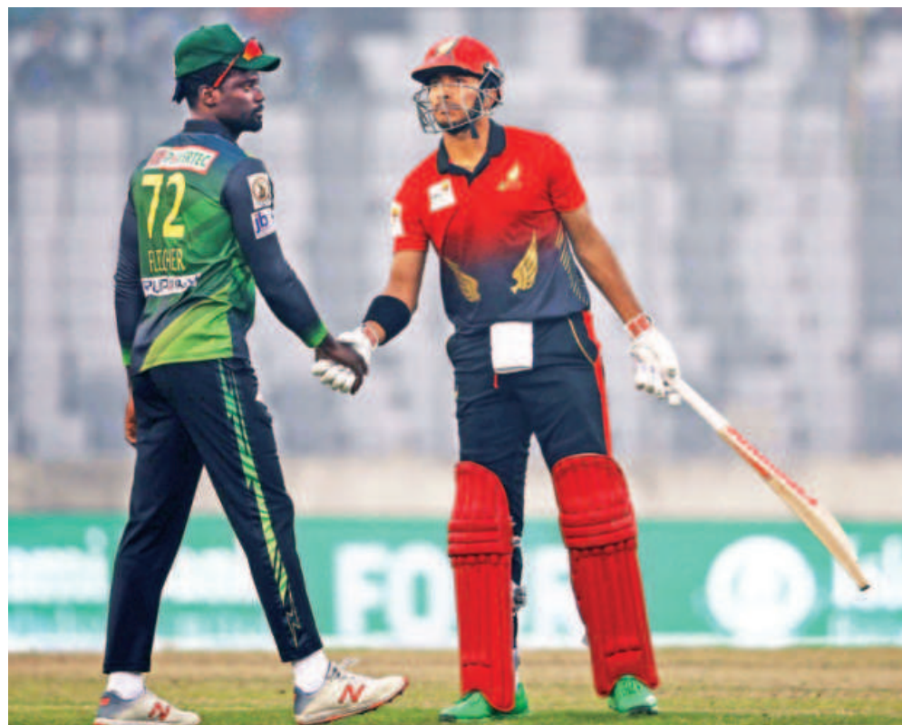
Sylhet Thunder skipper Andre Fletcher (L) cut a frustrated figure at the end of a wretched BBPL season, and particularly after losing their last match from a winning position against Cumilla Warriors in Mirpur yesterday.

SYLHET THUNDER: 141 for 5 in 20 overs (Fletcher 22, Mazid 45, Charles 26, Mendis 23; Al-Amin 2-30, Wiese 2-31) CUMILLA WARRIORS: 142 for 5 in 19.1 overs (Malan 58, Soumya 53 not out; Nayeem 3-21) Result: Cumilla won by 5 wickets. Player-of-the-match: Dawid Malan.