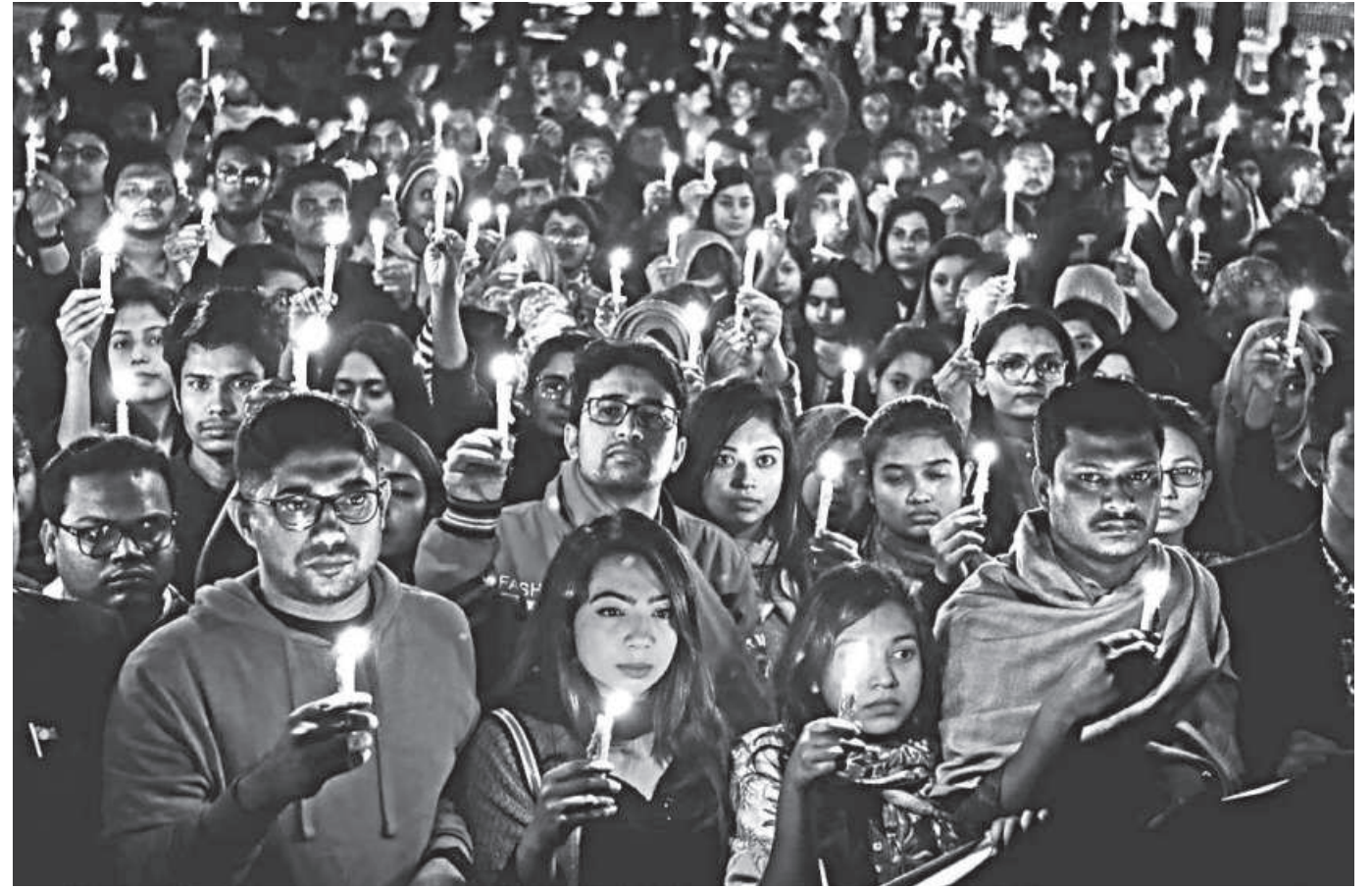
Students under the banner of Dhaka University Central Students' Union (Ducusu) hold a candlelight vigil on the Central Shaheed Minar premises, demanding justice for a fellow student who was raped in the capital's Kurmitola area on Sunday night.

A Dhaka University student being raped and left unconscious in a busy area speaks volumes of just how far this social