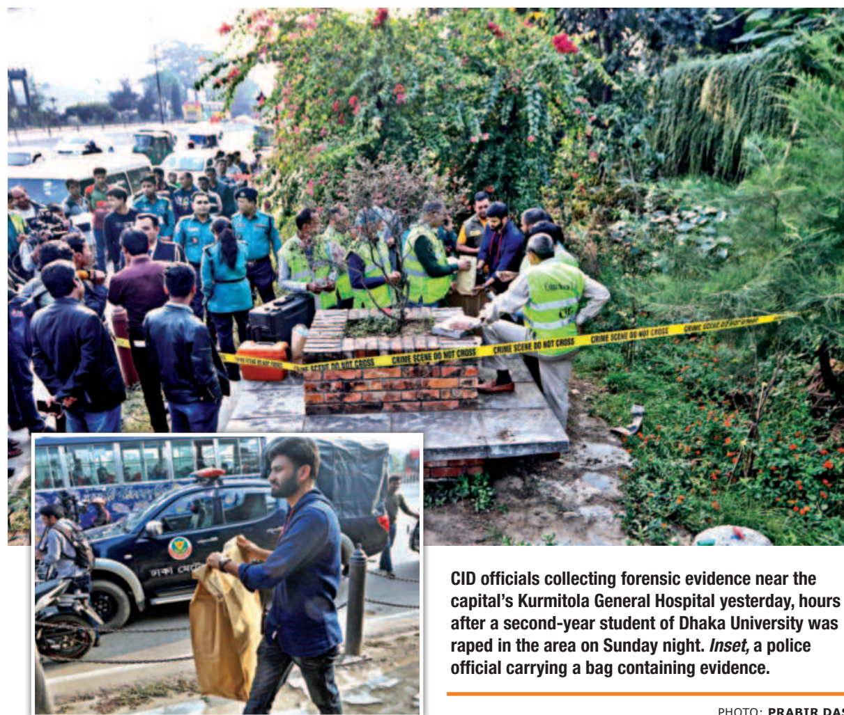
CID officials collecting forensic evidence near the capital's Kurmitola General Hospital yesterday, hours after a second-year student of Dhaka University was raped in the area on Sunday night. Inset, a police official carrying a bag containing evidence.

Indian makers Ashok Leyland supplied the double-decker buses, AC city buses, AC intercity buses while Tata Motors supplied the non-AC buses and 10.2-tonne trucks. VE Commercial Vehicle supplied the 16.2-tonne trucks.