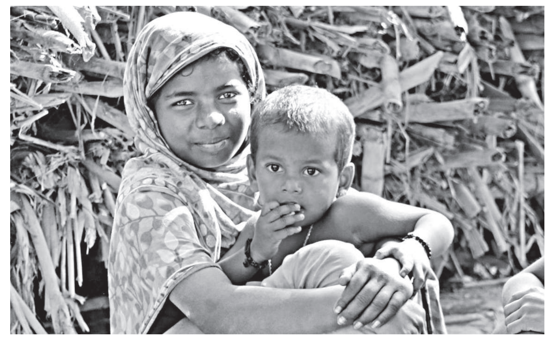
Two young Kora children in Korapara of Dinajpur's Biaral upazila. The small impoverished community, on the verge of extinction, awaits government protection against encroachers and necessary coverage under the government's social security programmes.