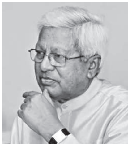
Sir Fazle Hasan Abed

At a later point, AUW faced some hurdles with the land that the government had allocated for its campus. As was our habit when we faced any serious problem, we went to Abed bhai for counsel. His response to our perceived crisis was that Brac had a sizable piece of land not too far from where the designated site for AUW was. If we needed it, we could have it. Two