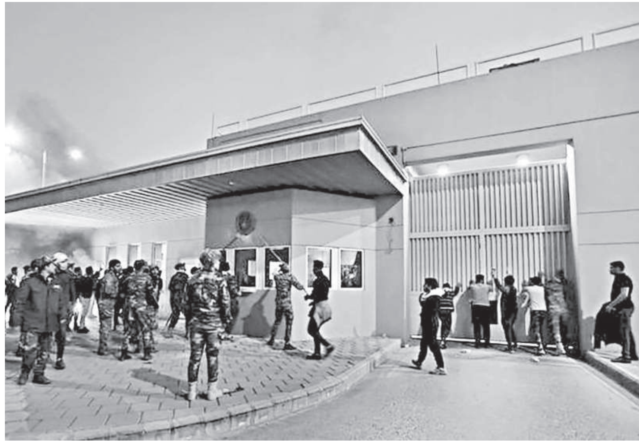
Protestors and militia fighters gather to condemn air strikes on bases belonging to Hashed al-Shaabi, outside the main gate of the US Embassy in Baghdad, Iraq, December 31, 2019.