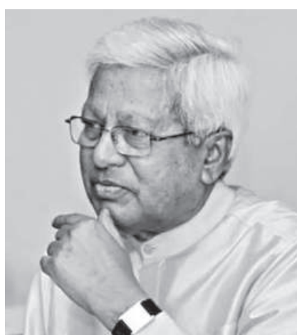
Sir Fazle Hasan Abed

At a later point, AUW faced some hurdles with the land that the government had allocated for its campus. As was our habit when we faced any serious problem, we went to Abed bhai for counsel. His response to our perceived crisis was that Brac had a sizable piece of land not too far from where the designated site for AUW was. If we needed it, we could have it. Two