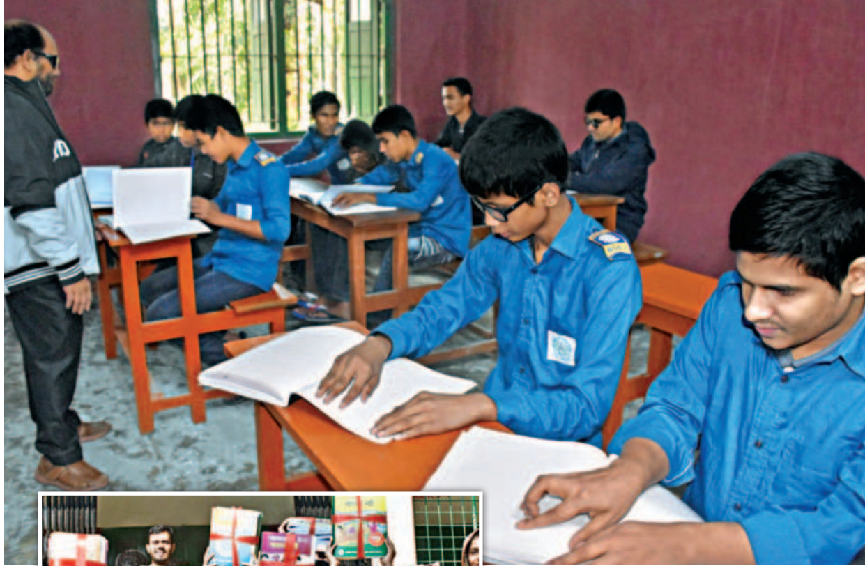
Visually impaired students reading their new books in class at the Sarkari Dristy Pratibandhi Bidyalay Barishal. Students, inset, rejoice after receiving braille books in time.

At least three military police officers were ordered to play Pokemon Go in Canadian bases across the country, after players invaded the facilities in a quest to catch them all. The interlopers were not foreign agents but fans of the wildly popular Pokemon Go app -- launched in 2016 -- trying to capture as many of the game's virtual characters as possible and even wandering into restricted army areas. A surge in the number of suspects being apprehended in the summer after the game's release puzzled the army, according to internal documents obtained by Canadian public television channel CBC. "Plse advise the Commissionaires that apparently Fort Frontenac is both a PokeGym and a PokeStop," Major Jeff Monaghan at Canadian SEE PAGE 10 COL 5