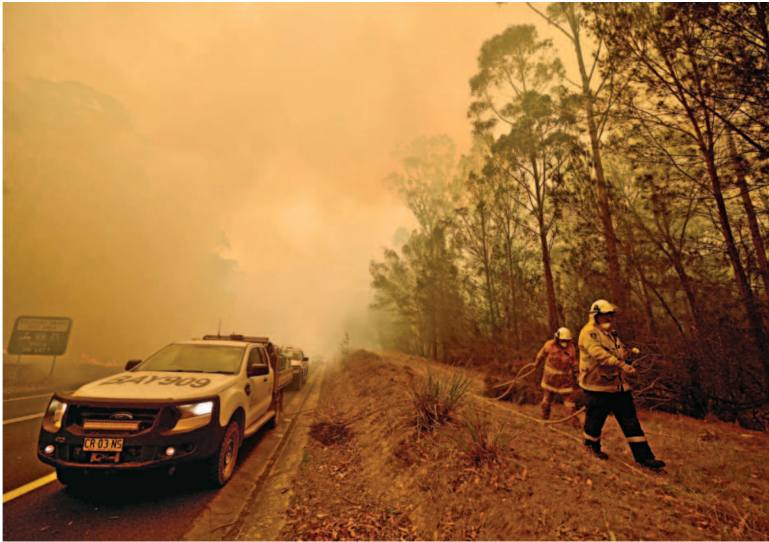
Firefighters tackle a bushfire in thick smoke in the town of Moruya, south of Batemans Bay, in New South Wales, yesterday.

If you have a child who struggles to recover from malnourishment despite being well fed, here is some good news for you. A team of scientists at the capital's icddr,b says the situation could be caused due to the presence of immature bacteria in the stomach and it could be overcome by feeding children a low-cost, easy-to-obtain food supplement made from banana, soya, Chinese nuts and chickpea. This supplement could be made at home just like the Oral Rehydration Solution (ORS) that saves millions of lives globally, according to the scientists. In a decade-long research and clinical trial, they found that if the certain types of immature microbiota are fed with specific food combination, those get mature, resulting in the end of malnutrition in children. This could overcome stunting, improper brain development or wasting (low weight-for-height), they said. This finding, first of its kind, has won the Breakthrough of the Year 2019 award by the American Association for the Advancement of Science (AAAS) journal. This finding is among the ten most significant developments in scientific research last year, said the journal. "The supplements performed well during a small trial, SEE PAGE 10 COL 5