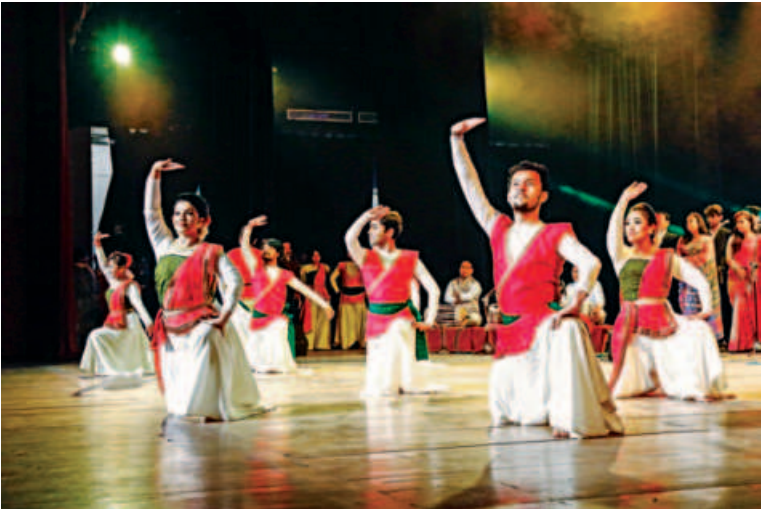
Artistes present a dance routine at the programme.

More than 5 thousand artistes from 64 districts, along with over a hundred cultural organisations, are participating in the festival. Each day will feature artistes from 3 districts, showcasing the vivid