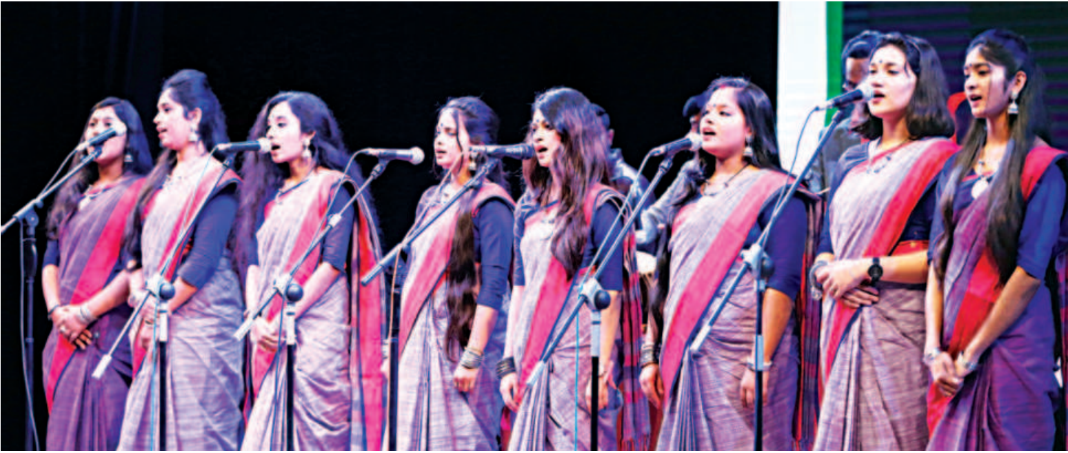
A musical performance at the event.

My year ended with the shooting sessions for Operation Sundarban . The film will release this year. Last year went pretty well for me, I am hoping this year to be a good one as well. I am already involved with some meaningful stories, and wish to be associated with more promising projects.