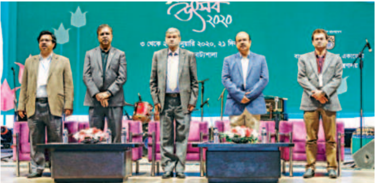
Guests at the inaugural ceremony.

Artistes from Bhola, Sunamganj, and Jhenaidah are set to perform today. The festival is open for all from 3 pm to 9 pm, every day at BSA premises till January 23.