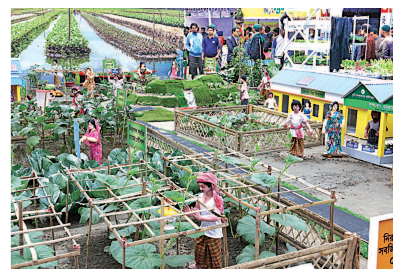
A model of a vegetable garden is on display at the National Vegetable Fair at the capital's Krishibid Institution Bangladesh yesterday. The agriculture ministry has organised the three-day fair with an aim to motivate people to consume vegetables and ensure safe vegetable production. Story on page 3.

US Secretary of State Mike Pompeo said the strike aimed to disrupt an "imminent attack" that would have endangered