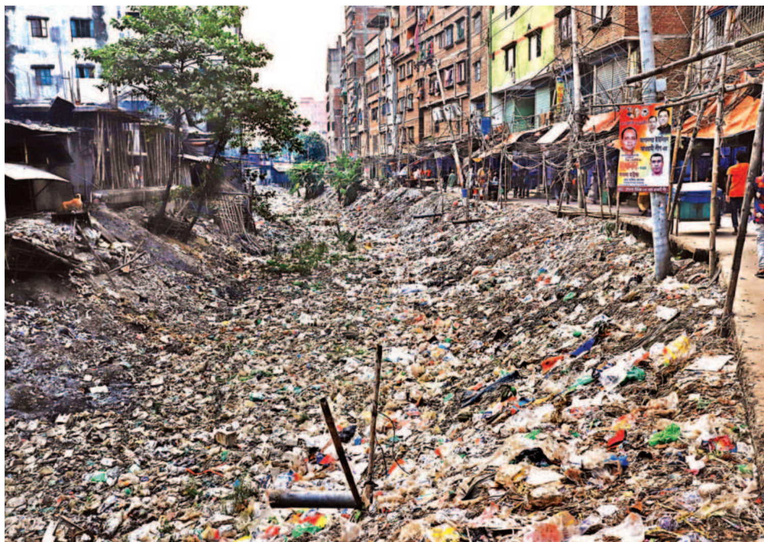
The Suvaddya canal is in its death throes as dumping of waste and rubbish into the canal goes on unabated. The photo was taken in Alam Market area of Dhaka's Keraniganj upazila recently.