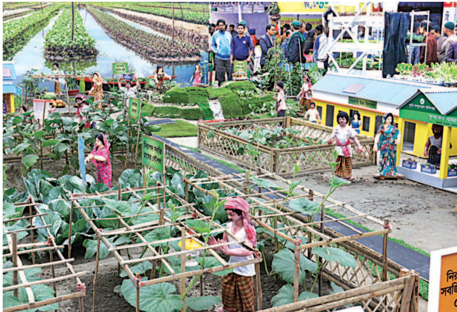
A model of a vegetable garden is on display at the National Vegetable Fair at the capital's Krishibid Institution Bangladesh yesterday. The agriculture ministry has organised the three-day fair with an aim to motivate people to consume vegetables and ensure safe vegetable production. Story on page 3.

US Secretary of State Mike Pompeo said the strike aimed to disrupt an "imminent attack" that would have endangered Americans in the Middle East. Democratic critics said the Republican president MORE ON PAGE 8 SEE PAGE 2 COL 3