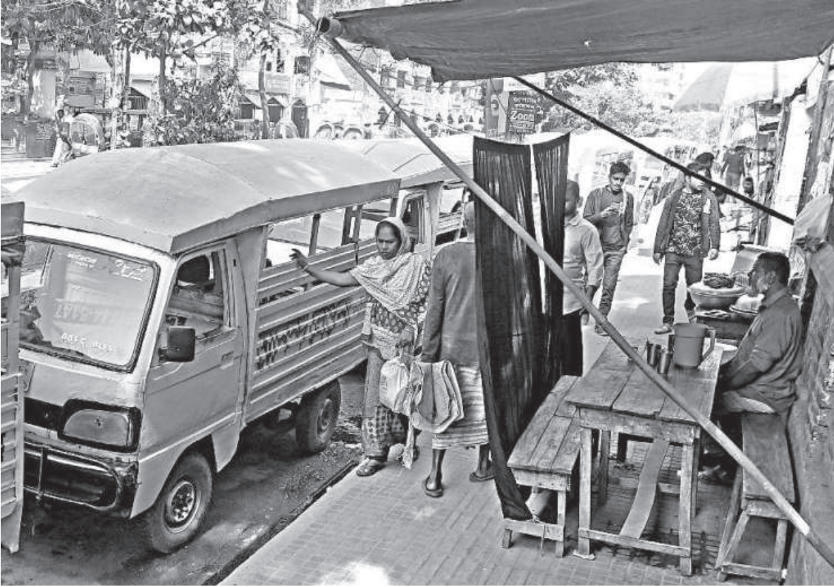
Almost the entire length of this footpath on Green Road remains occupied by vendors, leaving little to no space for pedestrians to walk. At the same time, the lane beside the pavement has become a parking spot for human hauliers. The photo was taken yesterday.

The grenade attack, masterminded by some BNP leaders, is one of the most shocking political crimes in the country's history.