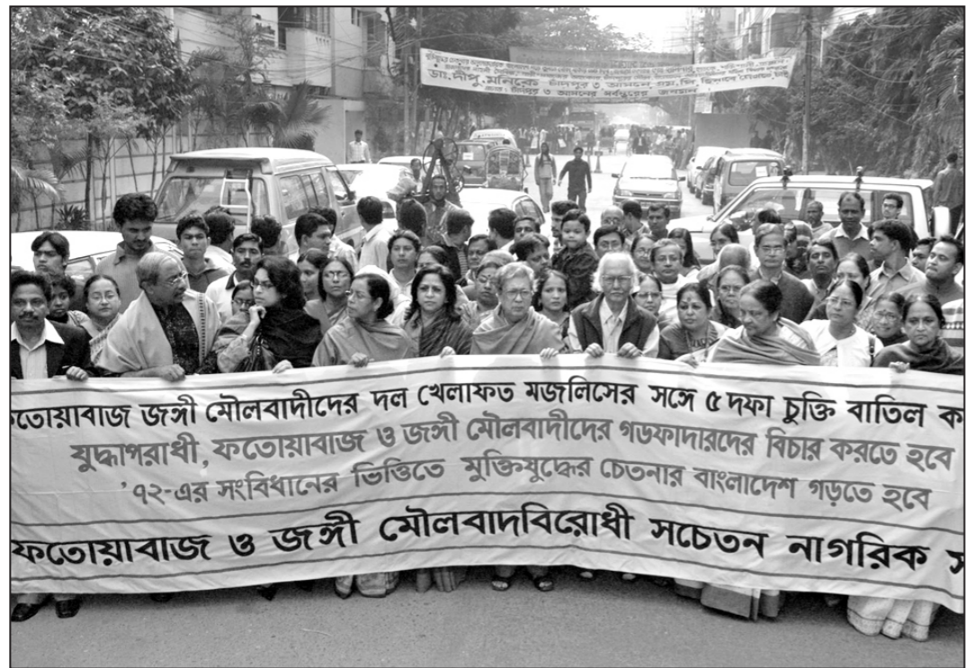
Members of Anti-fundamentalist and anti-militant Conscious Citizens' Society march towards Sudha Sadan in the city yesterday to submit a memorandum to Awami League President Sheikh Hasina demanding cancellation of a deal between AL and Khelafat Majlish.

A milad mahfil will be held after Zohr prayers at her Ramkrishnapur village home in Homna, Comilla. Relatives, friends and well-wishers have been requested to attend the milad.