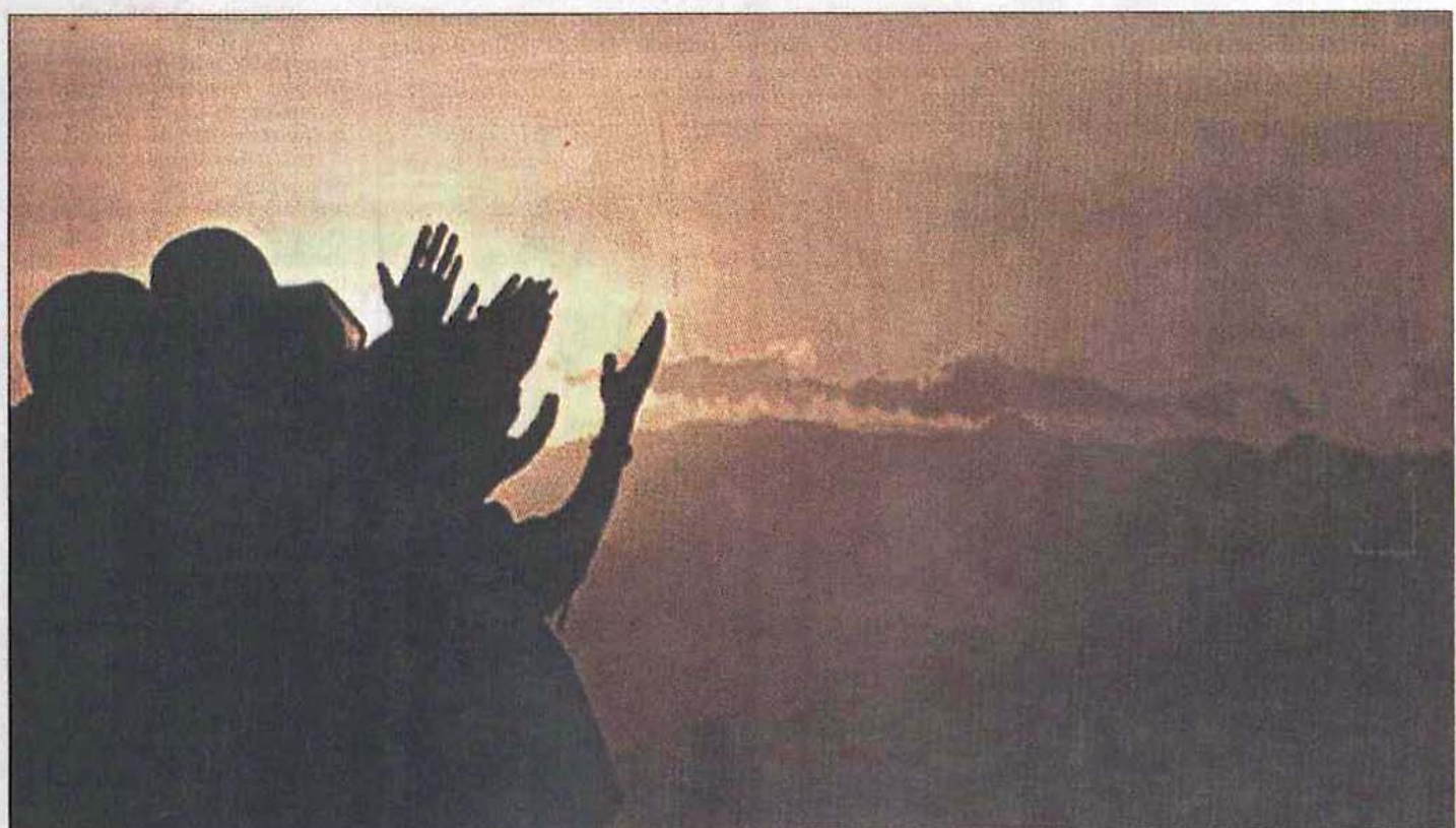
Pilgrims pray on the plain of Arafat near Makkah yesterday during the Hajj, the largest congregation of the Muslims.