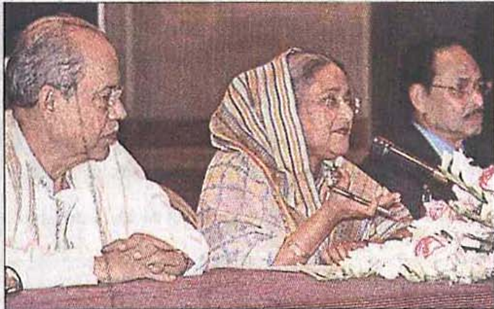
Flanked by former presidents— AQM Badruddoza Chowdhury, left, and HM Ershad—Awami League President Sheikh Hasina announces fresh agitation programmes yesterday.

"If the demands are not met even after the countrywide blockades, Bangabhaban will be blockaded indefinitely," Hasina said at the grand alliance news conference