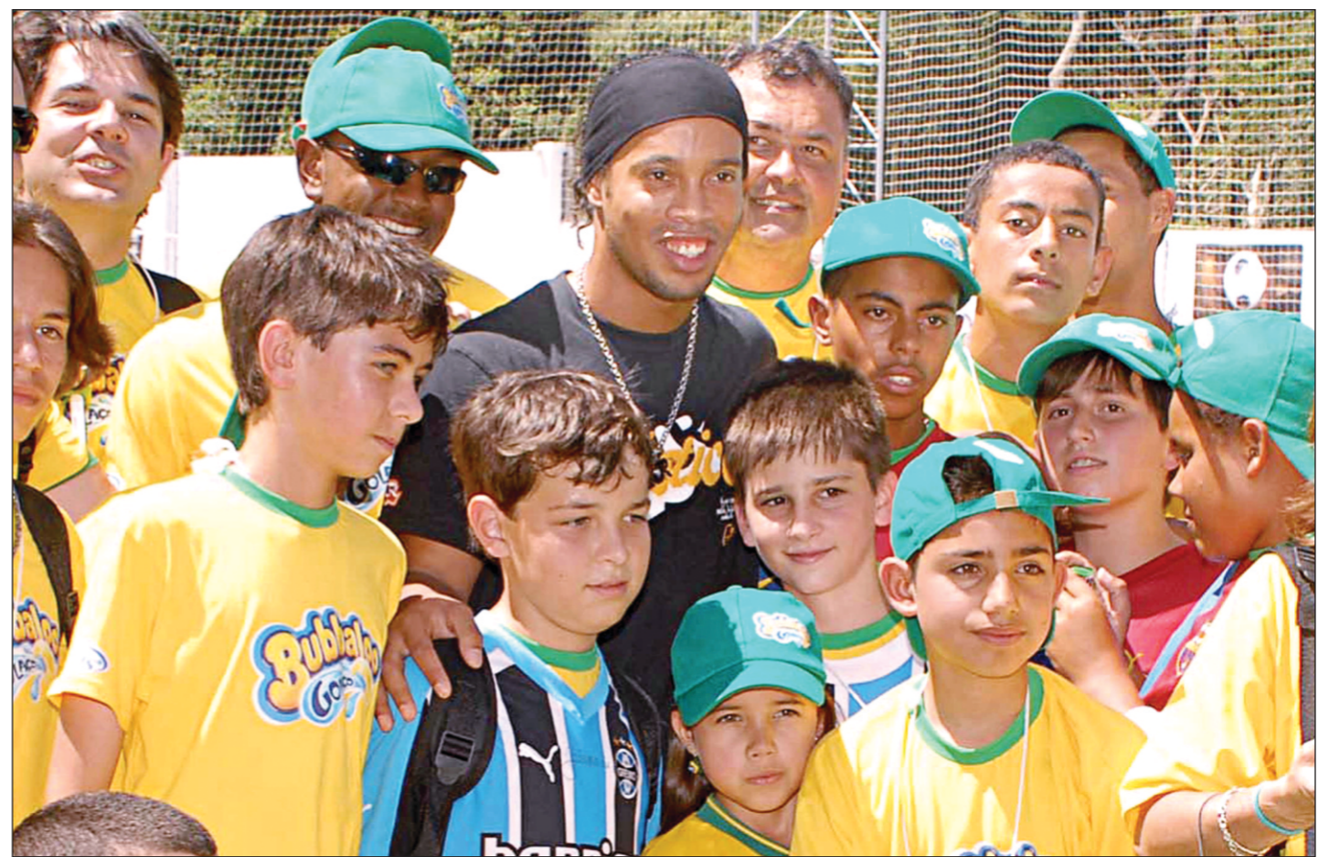
Brazil and Barcelona star Ronaldinho (C) poses with friends and children in Porto Alegre on Wednesday during the inauguration of the Ronaldinho Institute. Ronaldinho launched the institute which will allow children from low income families to practice sports.

"Equally, we believe that we understand the responsibilities that come with owning Liverpool Football Club. DIC has made it clear that, should a deal be concluded, it would not interfere in the day-to-day running of the club."