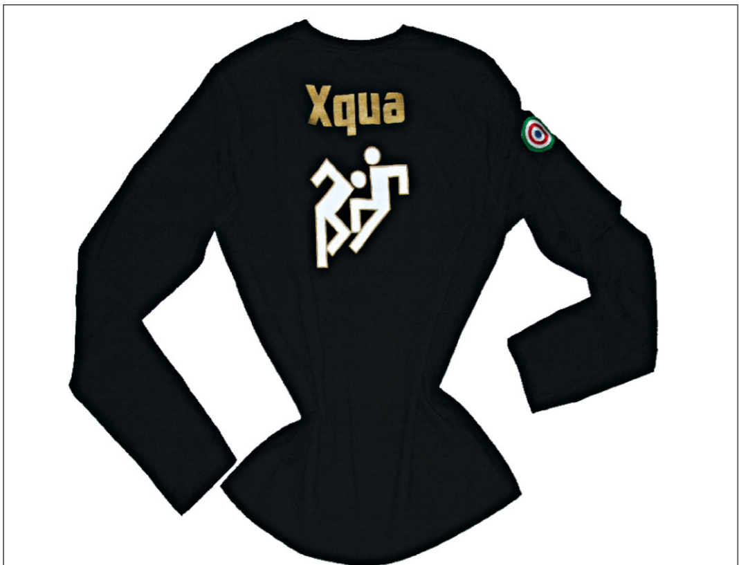
This undated handout picture showcases the new range of "Xqua" fleeces made by Italian fashion designer Alessandro Ferrari and inspired by Zinedine Zidane's infamous headbutt on Marco Materazzi in this year's World Cup final. The logo of the new range of leisurewear features a man headbutting another man.

"Let's battle back against all the ills that threaten our sport - racism, xenophobia, shady financial deals, illegal betting, unscrupulous agents and doping," he said.