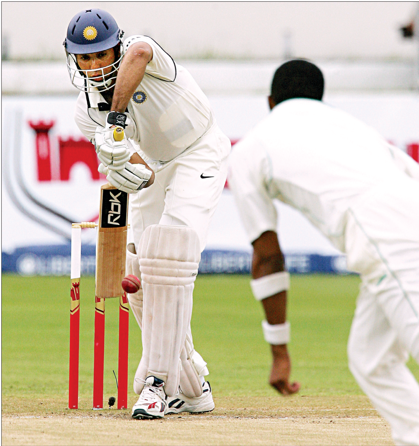
Indian batsman VVS Laxman plays a defensive stroke against South African paceman Makhaya Ntini on the third day of the second Test at the Kingsmead Stadium in Durban on Thursday.