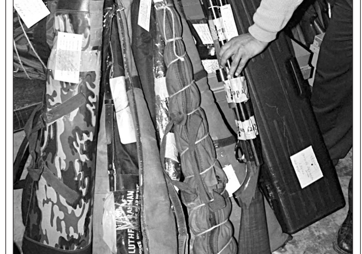
A policeman piles licensed firearms deposited with Gulshan Police Station in the city yesterday. Owners of the firearms brought those to the police station as the home ministry issued an order to deposit firearms ahead of the national election. The last date for depositing firearms has been extended until January 5.