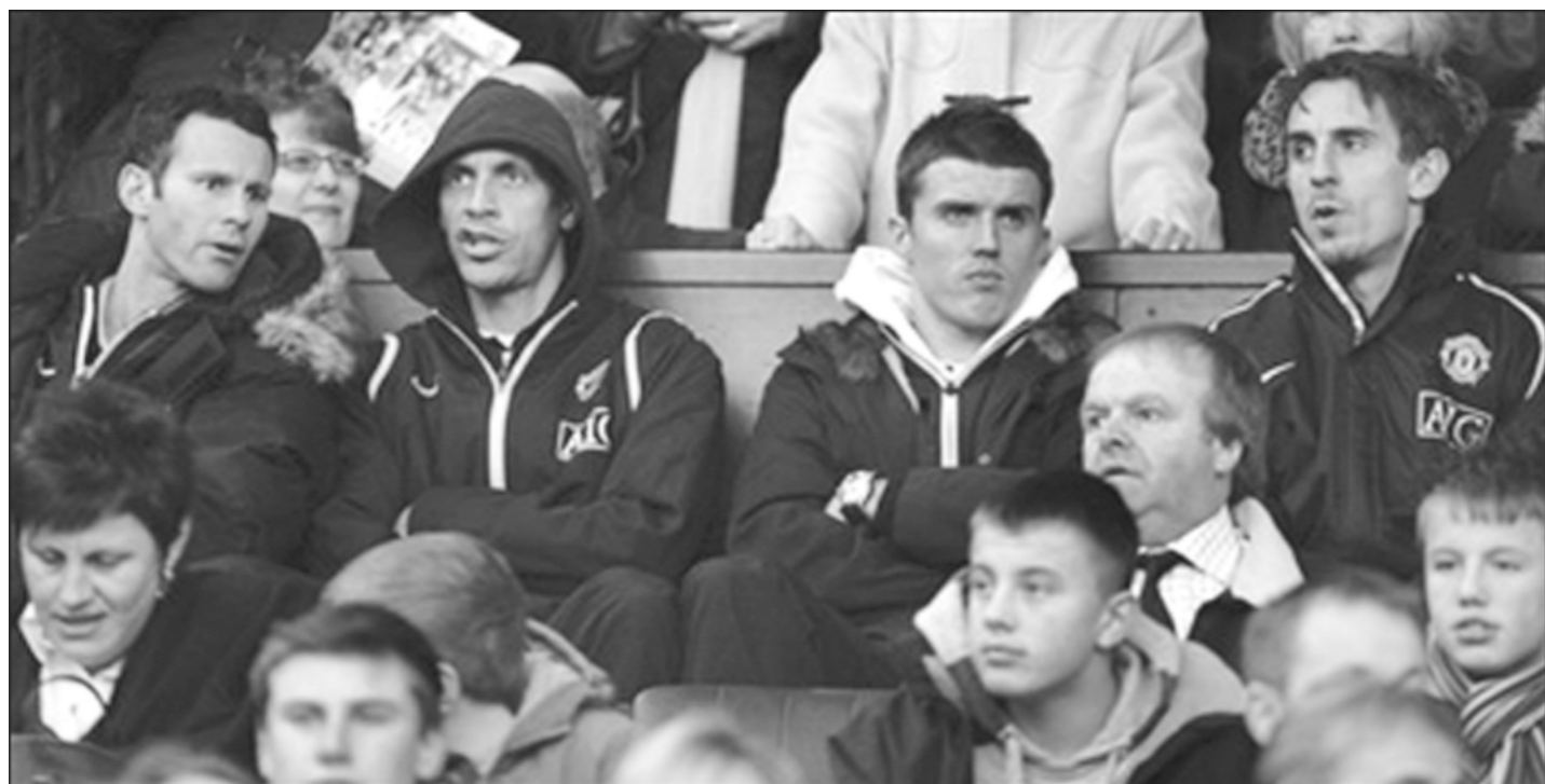
(From L-R) Manchester United stars Ryan Giggs, Rio Ferdinand, Michael Carrick and Gary Neville watch their team take on Wigan at Old Trafford on Tuesday. The quartet were rested for this fixture.