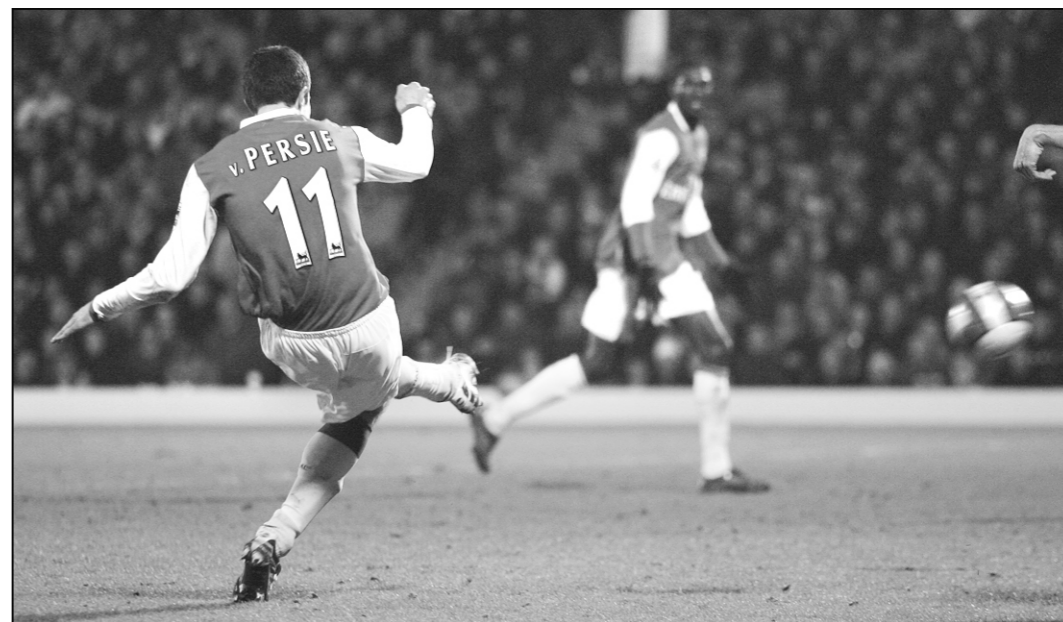
Arsenal striker Robin Van Persie scores a spectacular goal in their Premiership clash at home to Watford on Tuesday.

Wenger noted also the improvement in the 23-year-old van Persie's positional play -- another of Bergkamp's key attributes during his career. "It's difficult to teach somebody where to be on the pitch and the first quality of a football player is to know where to stand. He (van Persie) has that." Van Persie's winning goal against Watford was superbly set up by teenage English forward Theo Walcott. Controlling the ball near his own penalty area, Walcott played a perfect ball down the line into the path of the on-running Dutch international, who cut inside the box before unleashing a shot into the bottom corner. Watford manager Aidy Boothroyd was downhearted after having seen his side lose yet another match in the dying minutes, following similar defeats against Bolton, Portsmouth and Newcastle this season. "At the end I thought the goal could have been avoided," said Boothroyd, who must now pick up his players for Saturday's match against Wigan.