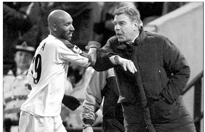
Nicolas Anelka (L) with manager Sam Allardyce