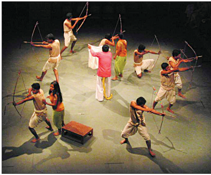
Scenes from Raarang (Top) and Mangula

First theatre festival on ethnic minorities coming up