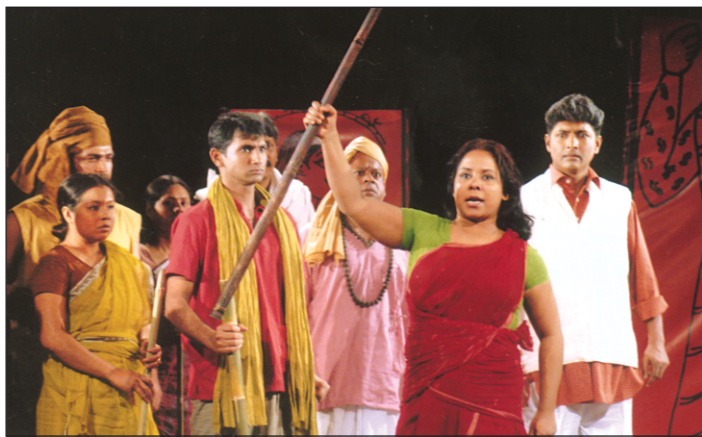
A still from Natyajan's latest production Anya Gazir Anya Kissa