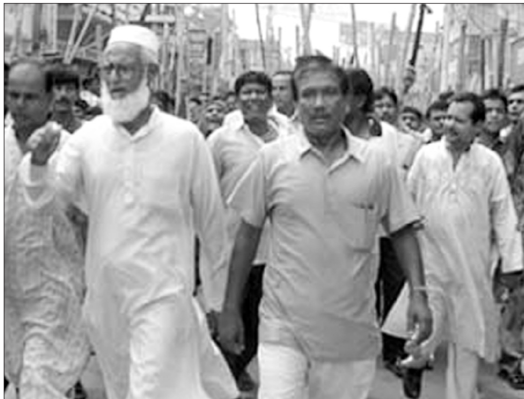
Quami Jute Mills workers and employees brought out a stick procession in Sirajganj town and held a rally yesterday for payment of arrear salaries and Eid bonus.