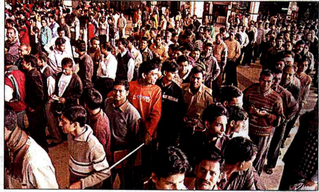
People, looking forward to spending their Eid holidays with their family members living outside Dhaka, stand in queues at Kamalapur Railway Station in the capital yesterday to purchase train tickets in advance.