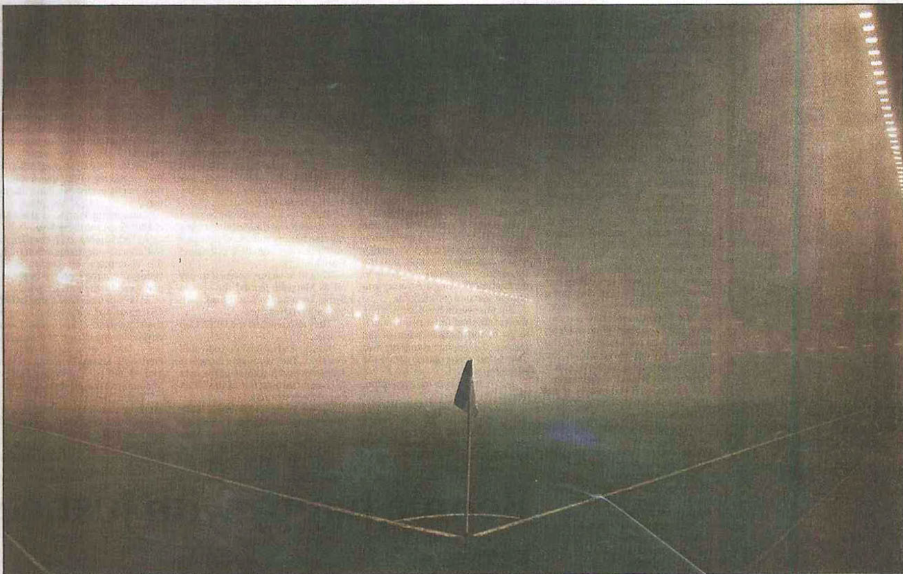
CAN'T SEE, CAN'T PLAY: A view of the fog-covered Anfield pitch that forced the cancellation of the League Cup tie between Liverpool and Arsenal on Tuesday.