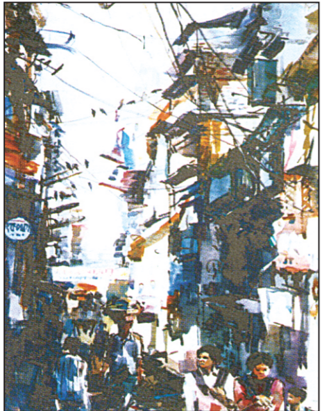
Splash of life in Shakhari Bazar by Alakesh Ghosh

Hamiduzzaman Khan's paintings dwell on nature in two pieces. The translucent and spontaneous watercolours give the effect of shining stainless steel pieces. They are called Nature 1 and Nature 2. "I've thrown in colours in a fun type way," Hamid says, adding, "The mingling of the gray colours forms the base of the vermilion, actual shindur (used for teep on the forehead). The scale is large but sophistication is maintained." The portrait presents two more overwhelming images (in watercolour). He says that