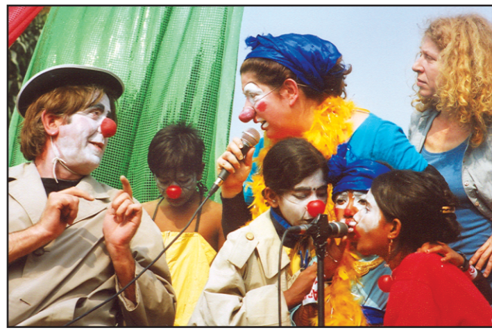
Clowns regale the children

In Dhaka, they will organise a workshop with children involved in theatre groups with Save the