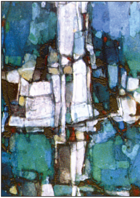
From the nature