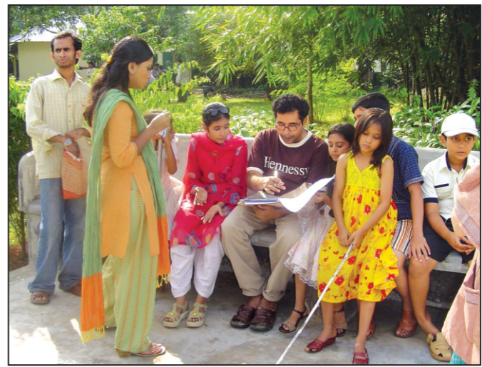
A still from the serial

A selected episode of children's drama serial Friends of Sindabad was awarded The Dodic Spittal Award recently, says a press release. This award was given to the serial in the course of Picture this... Canada's First International Disability Film Festival this year.