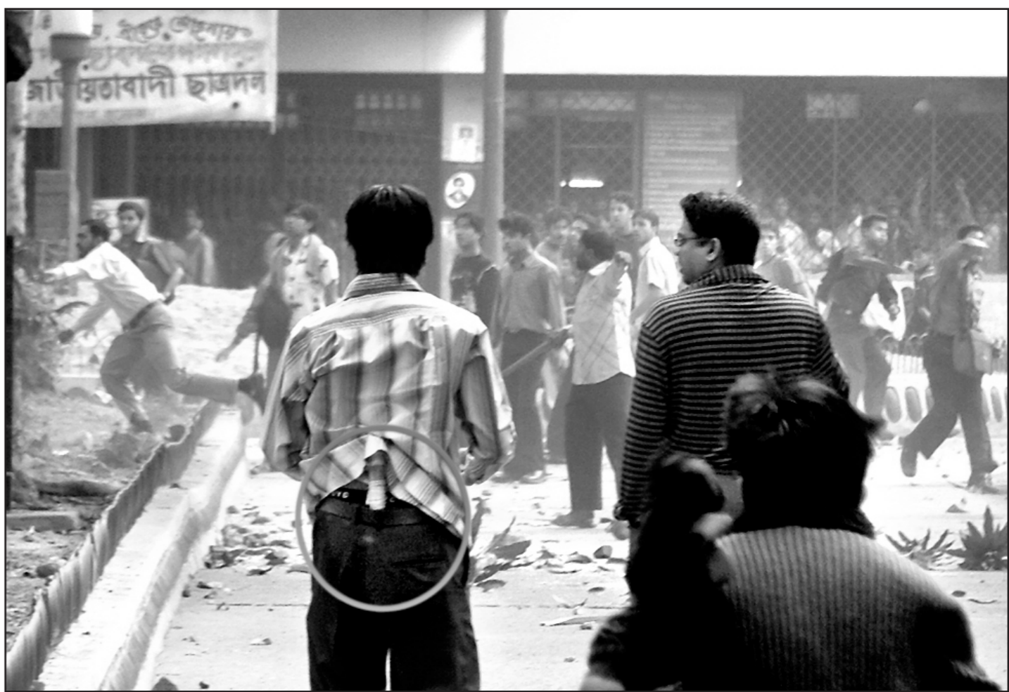
A Jatiyatabadi Chhatra Dal (JCD) activist, circled, with a chapati (chopping knife) tucked under his shirt during a clash with Islami Chhatra Shibir over allocation of seats in the dormitories of Chittagong Medical College yesterday.