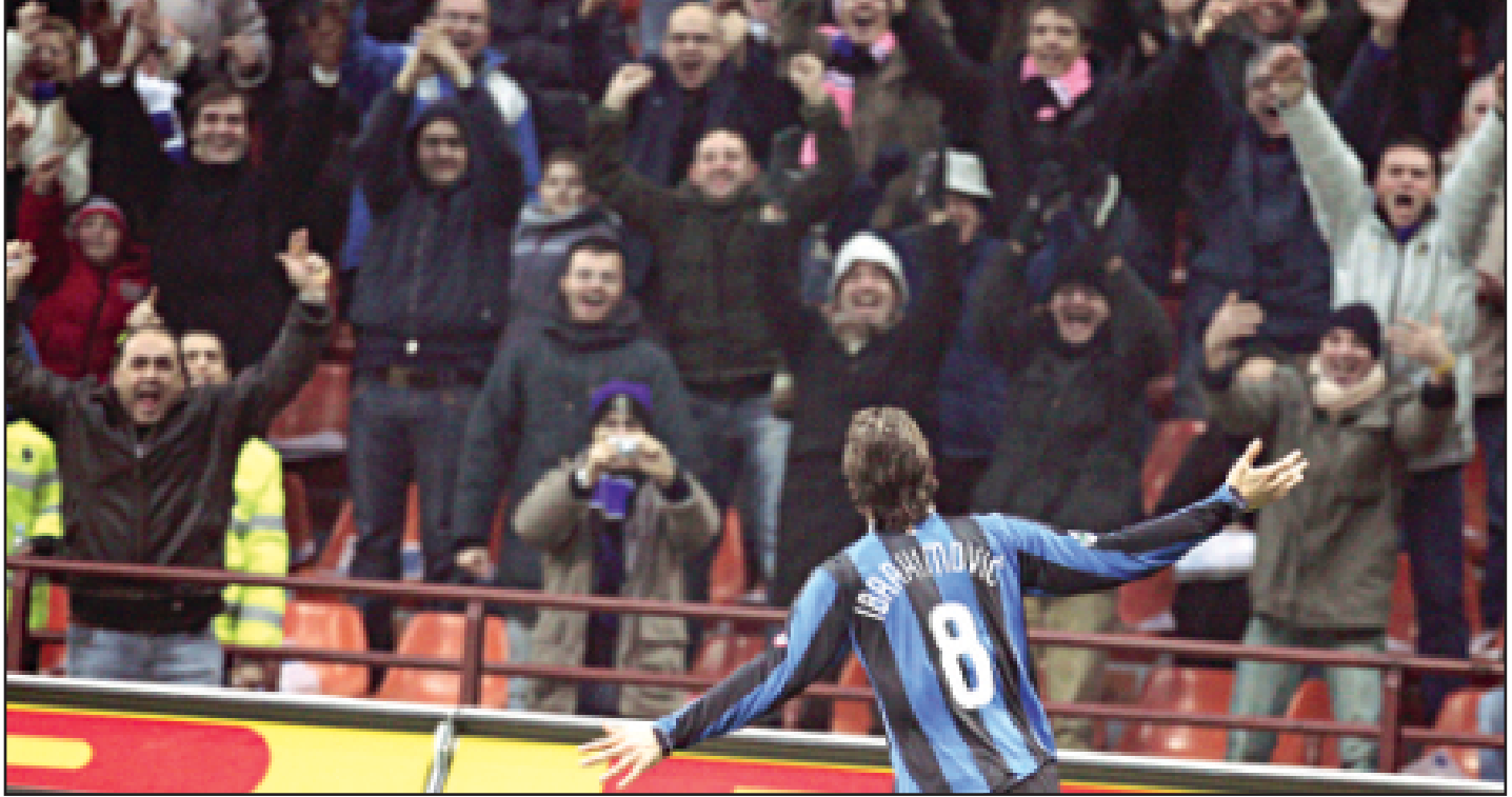
Inter Milan forward Zlatan Ibrahimovic celebrates his goal in front of home fans during their Serie A match against Messina at the San Siro in Milan on Sunday.