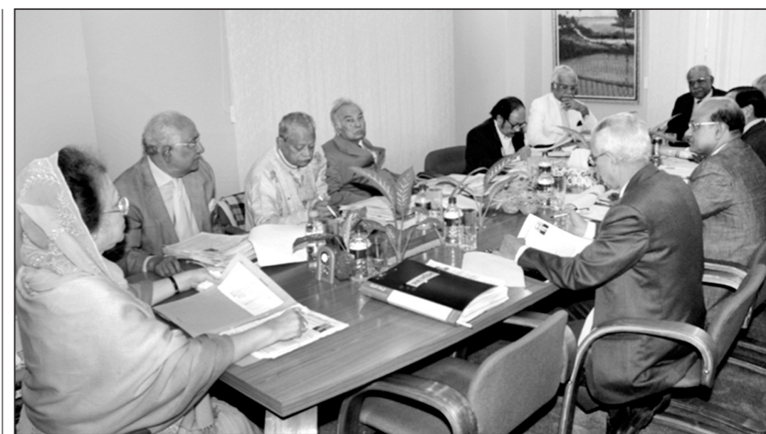
BNP Nomination Board headed by party chief Khaleda Zia interviews nomination seekers of Dhaka at her Banani office in the city yesterday.