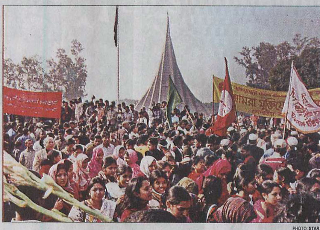
Thousands throng the National Memorial at Savar yesterday morning to pay homage to the Liberation War martyrs on the 35th Victory Day.