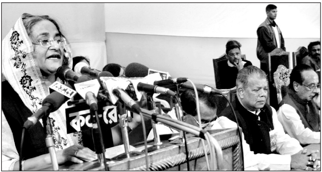
Awami League President Sheikh Hasina speaks at a discussion organised by AL at Dhanmondi in the city yesterday marking the Martyred Intellectuals Day.