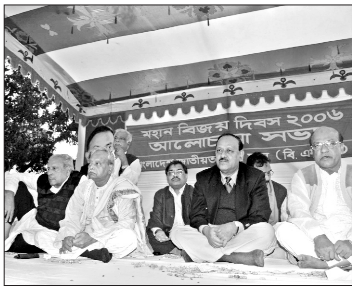
BNP leaders at a discussion organised by BNP at Ramna Botomul in the city yesterday on the occasion of the Victory Day.