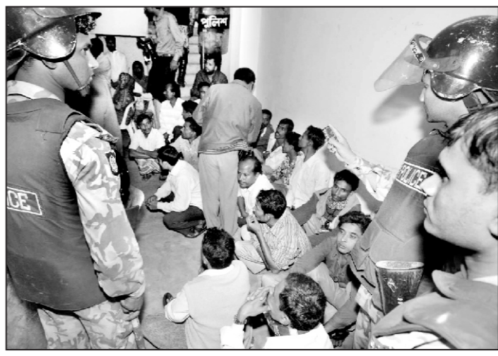
Police picked up a number of Jatiya Party activists who vandalised vehicles at Paltan intersection in the city yesterday to protest High Court's verdict that handed party Chairman HM Ershad two year's imprisonment.