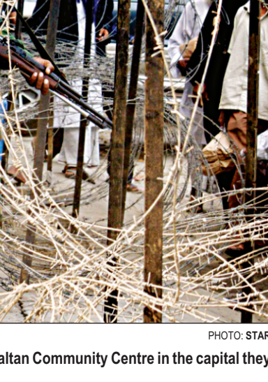
Troops stand guard yesterday behind a barbed wire fence around Naya Paltan Community Centre in the capital they now use as a temporary camp.