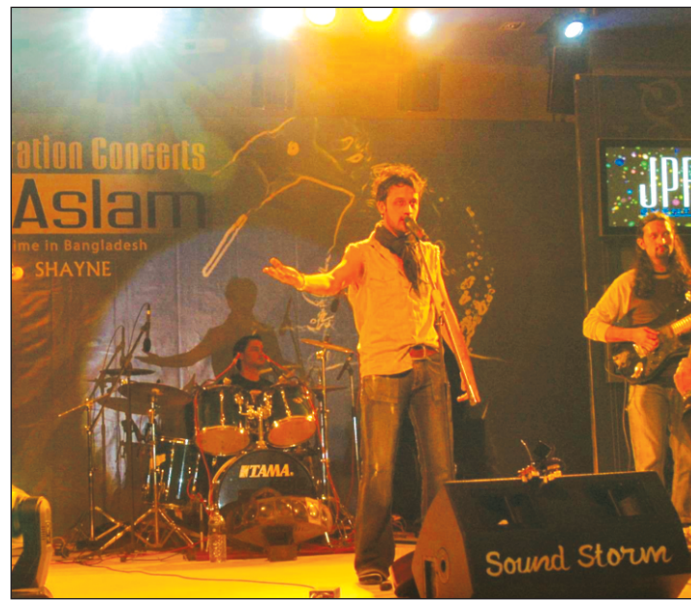
Atif Aslam (C), the popular Pakistani singer performed at concerts in Dhaka recently. He took the stage at different venues such as Radisson Hotel, Dhaka Club, International Club and the PM lounge.

BGTFF in its executive committee meeting held on December 7, has decided to arrange the festival in February 2007.