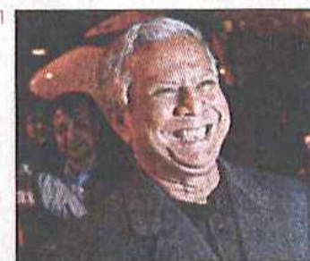
Prof Muhammad Yunus