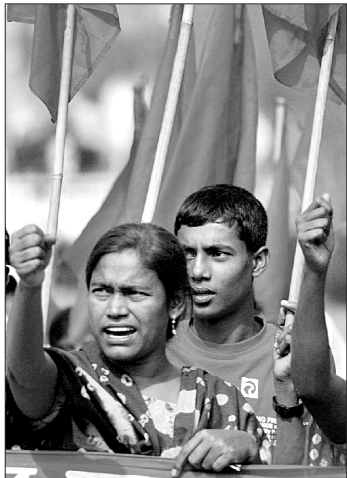
Jatiya Garment Sramik Federation stages a demonstration at Muktangan in the city yesterday demanding implementation of the government decision to grant a minimum wage of Tk 1662.