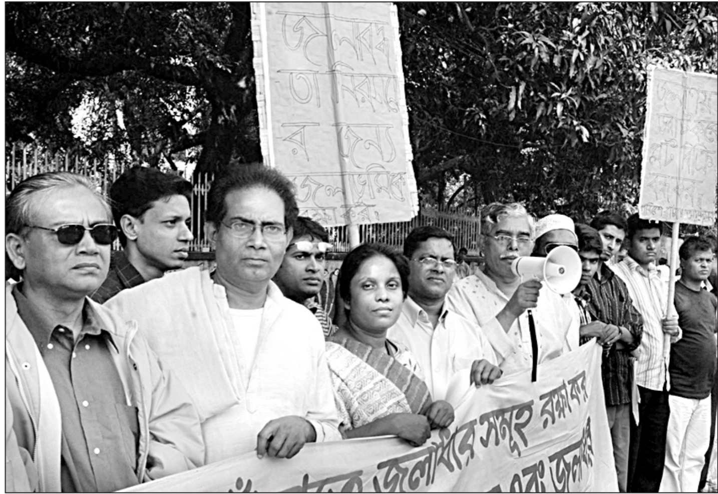
Bangladesh Paribesh Bachao Andolon forms a human chain in front of Fine Arts Institute in the city yesterday protesting earth filling of the water bodies.

Police sent the body to CMCH morgue for autopsy.